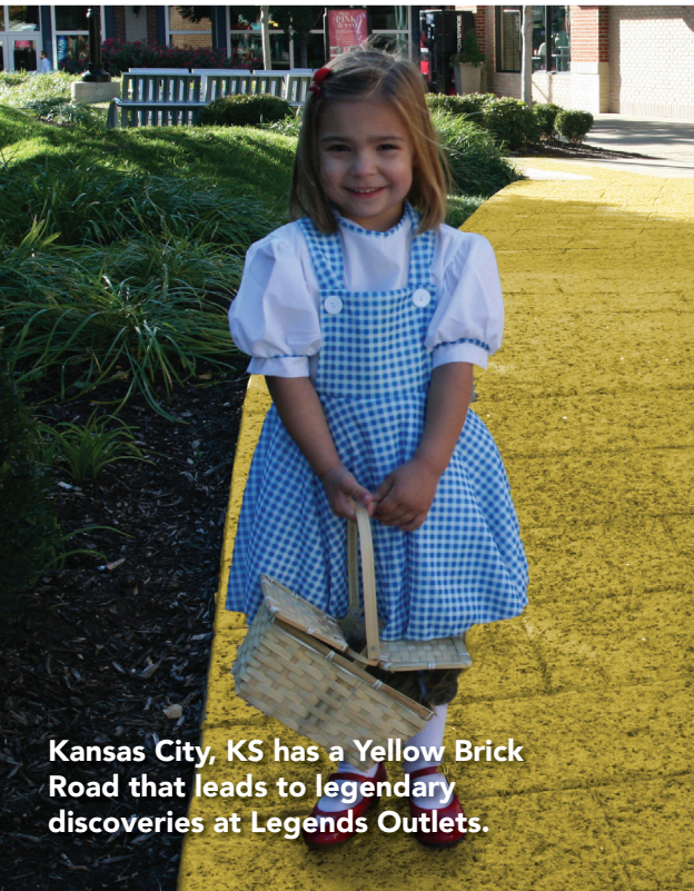
Kansas City, KS has a Yellow Brick Road that leads to legendary discoveries at Legends Outlets.

The highest Rooftop Patio in Kansas City, Kansas is at Dave & Buster's.