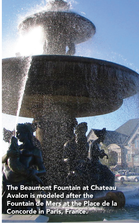
The Beaumont Fountain at Chateau Avalon is modeled after the Fountain de Mers at the Place de la Concorde in Paris, France.

Average High Daily Temperatures in Fahrenheit