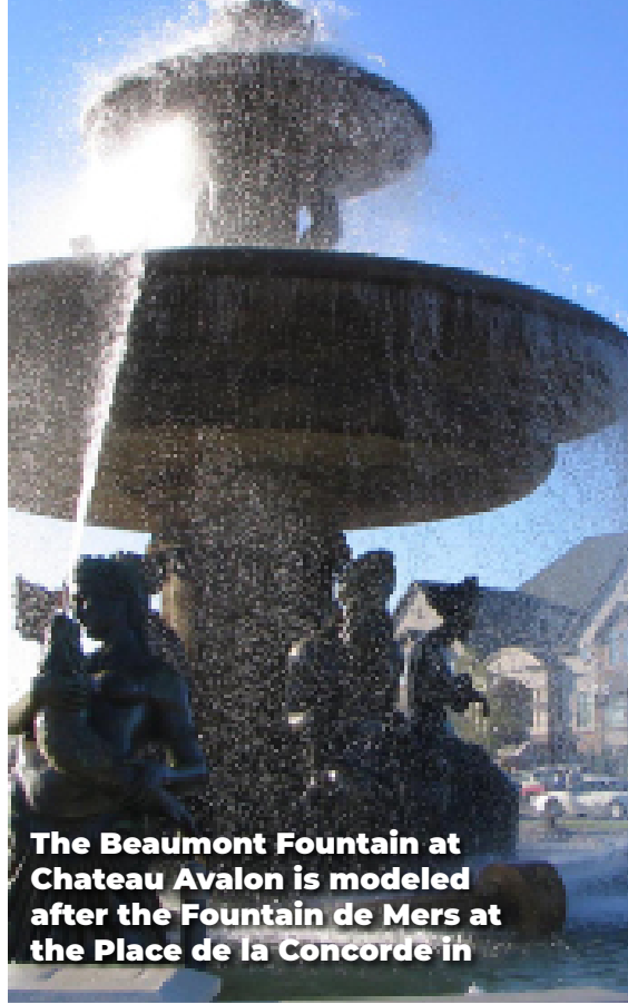
The Beaumont Fountain at Chateau Avalon is modeled after the Fountain de Mers at the Place de la Concorde in

Average High Daily Temperatures in Fahrenheit