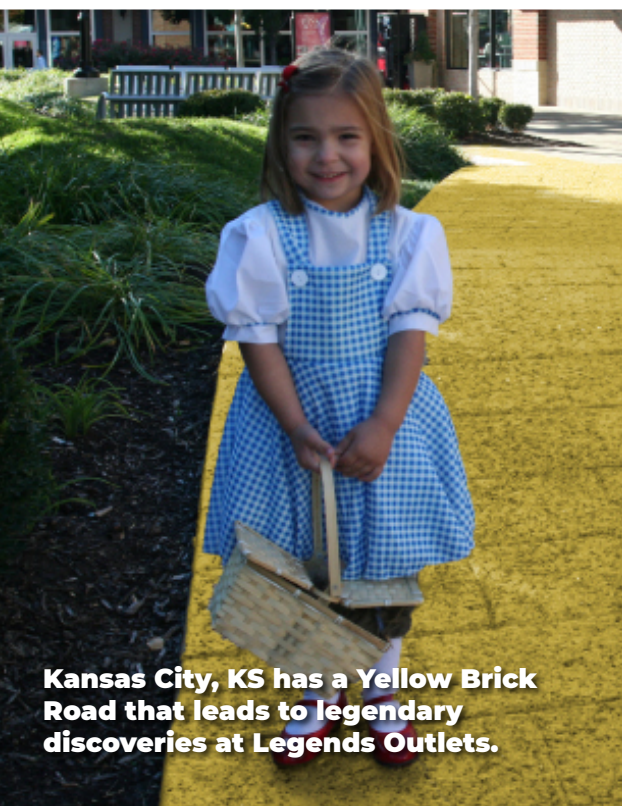
Kansas City, KS has a Yellow Brick Road that leads to legendary discoveries at Legends Outlets.

The highest Rooftop Patio in Kansas City, Kansas is at Dave & Buster's.