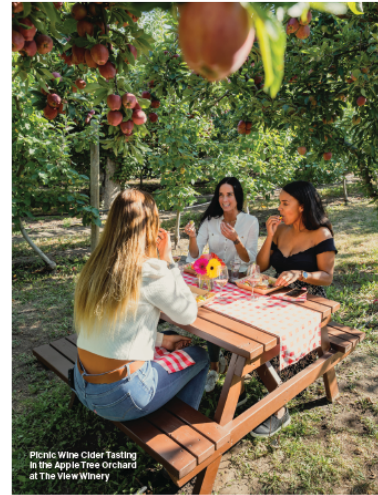
Picnic Wine Cider Tasting in the Apple Tree Orchard at the View Winery