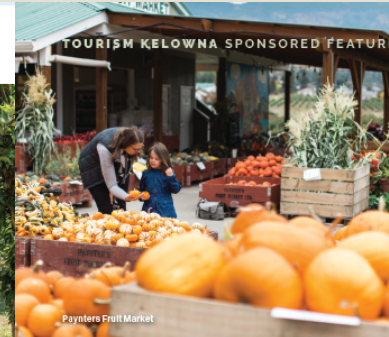
Paynter's Fruit Market

Wards Hard Cider – For Cider With apple orchards in the Okanagan Valley, Wards' Cider in Southeast Kelowna crafts gluten-free, organic, local ciders. Head to the tasting room to try the local ciders on offer, or shop online from the traditional craft ciders, cocktail ciders and low-calorie tea-infused ciders. This local cidery has been growing for over a century, with original trees planted in the early 1900s still giving fruit today.