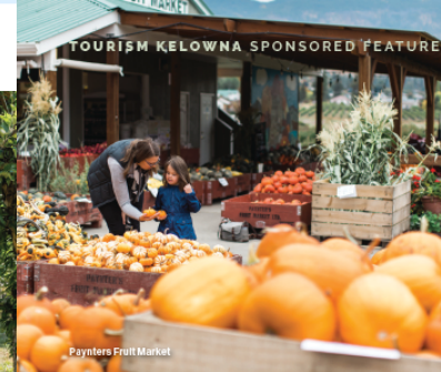
Paynter's Farm Market