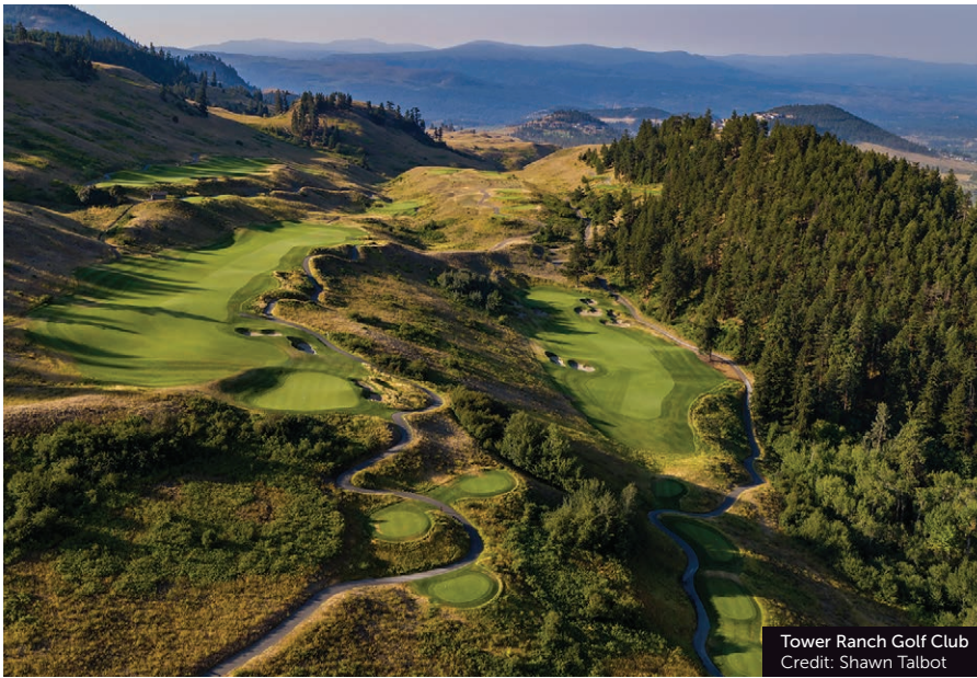
Tower Ranch Golf Club