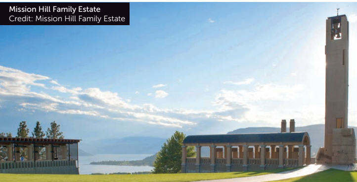
Mission Hill Family Estate

Kelowna's not just about wineries. In recent years, there's been a surge of craft breweries, cideries, and distilleries popping up all over Kelowna. Visit one of our local tasting rooms, order a flight, and learn how a small-batch craft brewery operates.