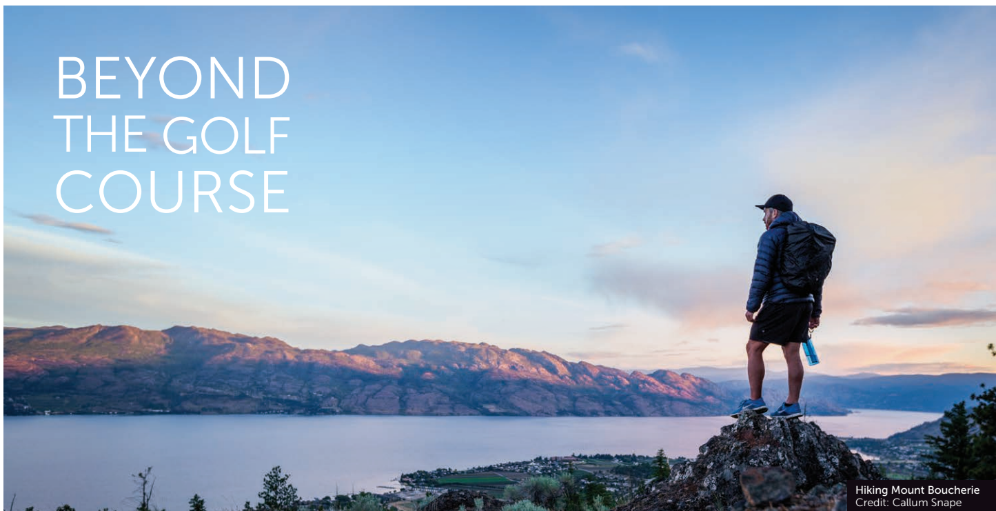
Hiking Mount Boucherie