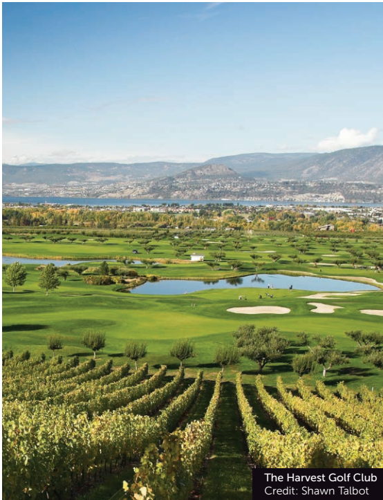
The Harvest Golf Club