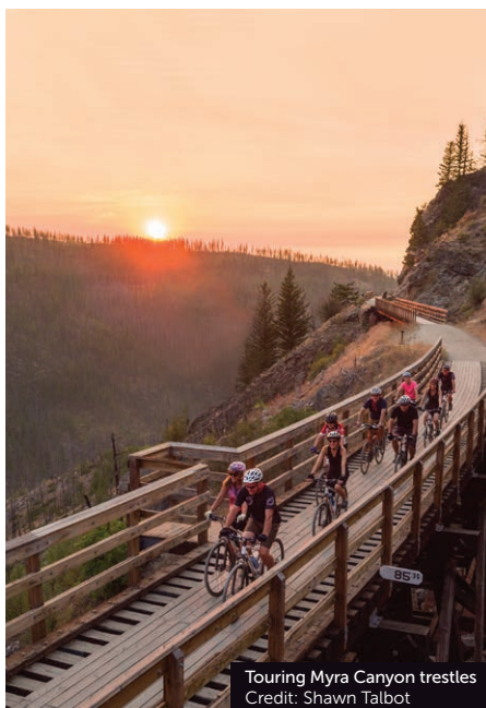
Touring Myra Canyon trestles