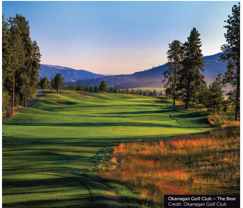
Okanagan Golf Club – The Bear