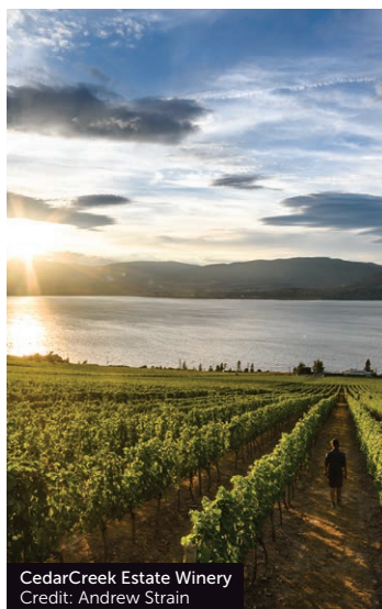
CedarCreek Estate Winery