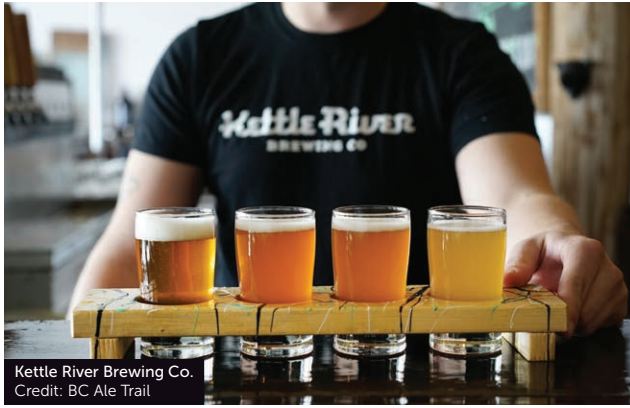
Kettle River Brewing Co.