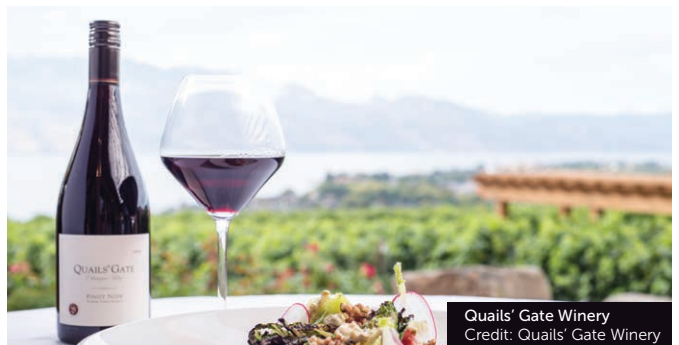
Quails' Gate Winery

Wine and golf are a perfect pair. Discover the variety of our local wines as you tour our five distinct wine trails. You will be pleasantly surprised as you travel through vineyards, orchards, and farms just minutes from the city. Whether it's spring, summer, fall, or winter, expect to be enchanted as knowledgeable proprietors, dedicated hosts, and award-winning winemakers pour their wine and share their stories.