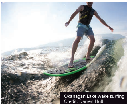
Okanagan Lake wake surfing