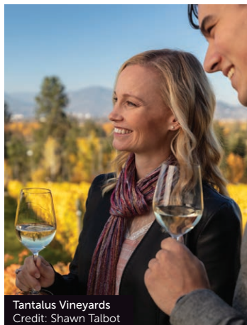
Tantalus Vineyards

FROM WINE AND ALE TRAILS TO HIKING AND BIKING TRAILS – KELOWNA'S GOT IT ALL.