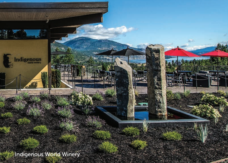
Indigenous World Winery