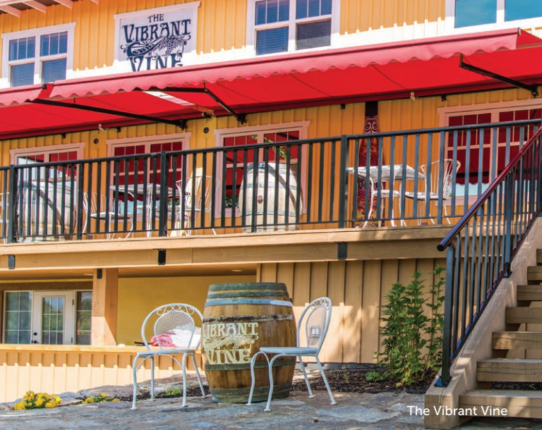
The Vibrant Vine