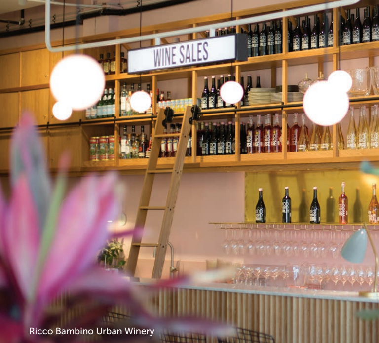
Ricco Bambino Urban Winery