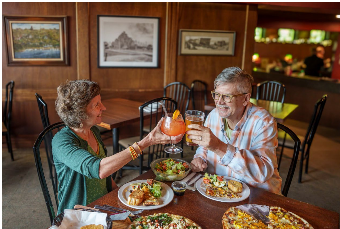
Figure 2: According to MEDC, visitors contributed a combined $126 million to the Keweenaw region in 2023.