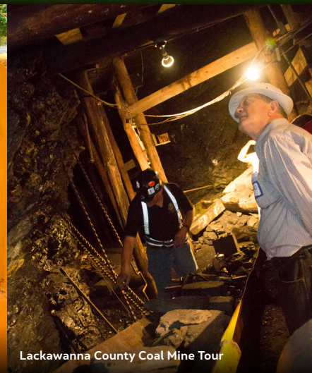
Lackawanna County Coal Mine Tour