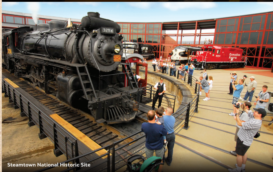
Steamtown National Historic Site