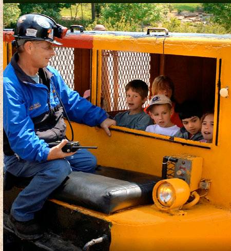
Lackawanna County Coal Mine Tour