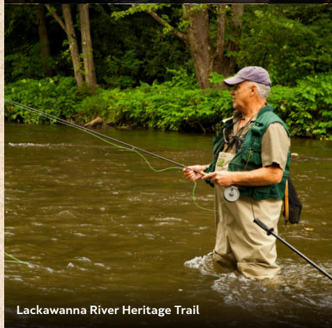
Lackawanna River Heritage Trail