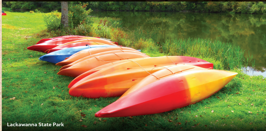
Lackawanna State Park