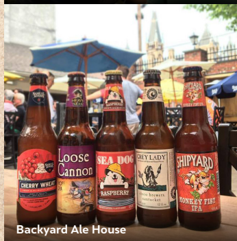
Backyard Ale House