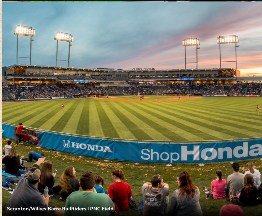
Scranton/Wilkes-Barre RailRiders | PNC Field