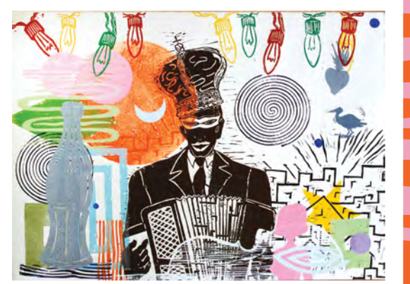
Cover Art: King of zydeco with Mask and coke ©2008 Francis X Pavy · Pavy.com

Grammy Award winning Zydeco musician, Chubby Carrier, will serve up a spicy cup of soul with a dash of history and a hint of curiosity. Experience the evolution of Zydeco music from its African and French beginnings through live performances and listener participation. Available for groups Monday-Thursday during the day.