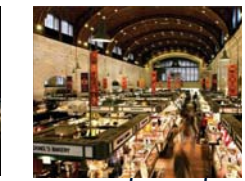
West Side Market