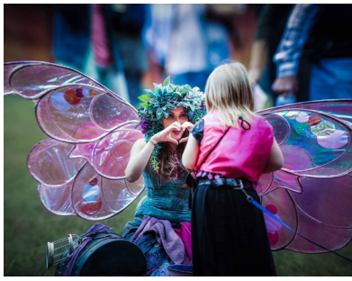
Carolina Renaissance Festival