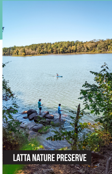
LATTA NATURE PRESERVE