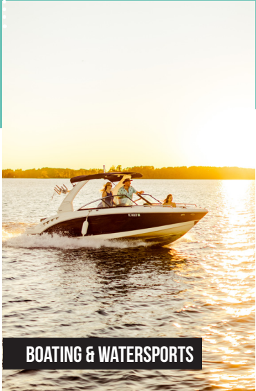
BOATING & WATERSPORTS