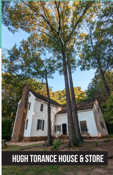
HUGH TORANCE HOUSE & STORE