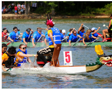
Asian Festival & Dragon Boat Race

Lake Norman hosts many unique annual events that are sure to please. Some of our favorites include Rural Hill's Loch Norman Highland Games (Apr) , Art on the Green (Apr) , Tawba Walk (May & Sept) , Amazing Maize Maze (Sept-Oct) , Laktoberfest (Oct) , Carolina Renaissance Festival (Oct-Nov) , Charlotte Asian Festival & Dragon Boat Race (May) , and Annual Lighted Boat Parade (Dec) .