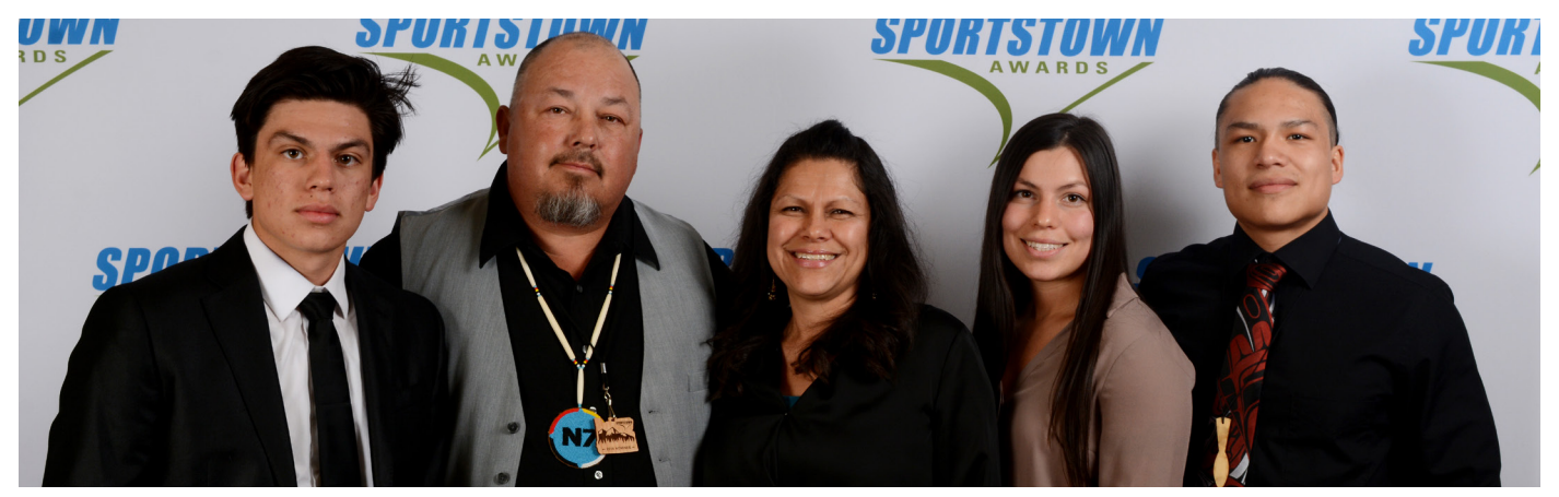
Inspirational Coach of the Year Award Nominee and Family