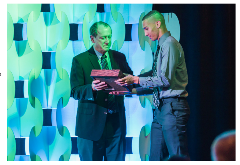
Athlete with Heart Award Winner

The top awards of the evening, the Male and Female Student Athlete of the Year, honors two nominees from each Lane County high school. The evening is a highlight for both nominees and their families.