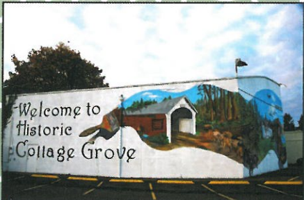
Welcome To Cottage Grove Mural - This mural is painted on the east and south walls of the Moose Lodge, located at 711 Highway 99S (Near the intersection of Highway 99 and Harrison Street). Artist: Suzi Marquess Long . 2004