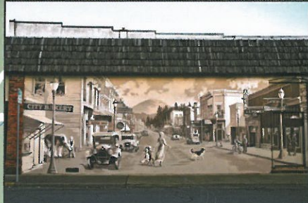
1920's Main Street Scene Mural - This 12' x 73' mural is on the west wall of 501 East Main Street, currently operating as Shoestrings. The mural is an authentic rendering of Main Street, Cottage Grove in the 1920's, as recorded in a photo from the period. Artist: Connie Huston . 2007

Murals 1 through 5 sponsored and funded by the Cottage Grove Mural Committee