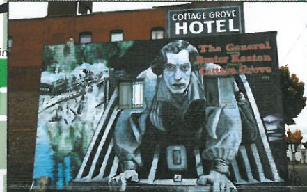
Buster Keaton Mural - This mural is painted on the east wall of the building adjacent to the old Cottage Grove Hotel, which is located at the intersection of Highway 99 and Main Street. The mural commemorates the motion picture, "The General," which was filmed near Cottage Grove in 1926. Artist: Howard Tharpe . 2002