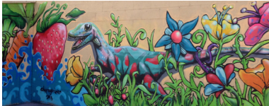
1c Wynant's Family Health Foods (722 South A St) Artist: Bayne Gardner Title: Untitled (Velociraptor) Date: 2015