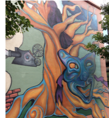
4 Academy of Arts & Academics (615 Main St) Artists: A3 Students Title: Express Yourself (left) Date: Summer of 2008