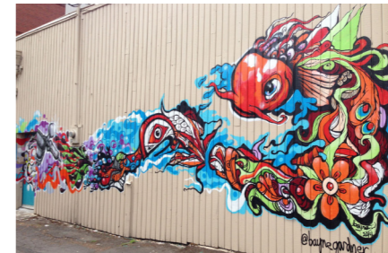
7 Memento Ink (525 Main St, back) Artist: Bayne Gardner Title: Untitled Date: 2014