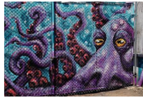
2 The Nautilus Tropical Fish (727 Main St, back) Artist: Bayne Gardner Title: Untitled (Octopus) Date: 2015