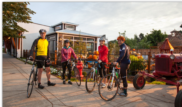
Biking through Coburg

The tourism industry creates revenue for vital city and county needs. Local, state and federal tax revenue generated by visitors to Lane County is $42 million , providing support for local parks, economic development and the arts.