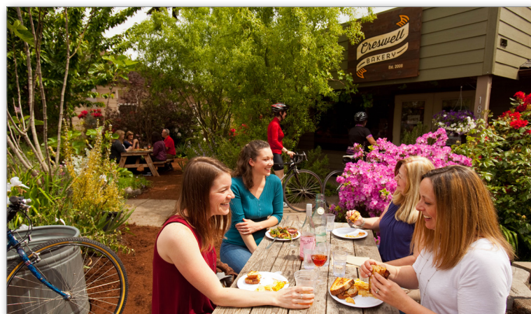
Creswell Bakery, Creswell