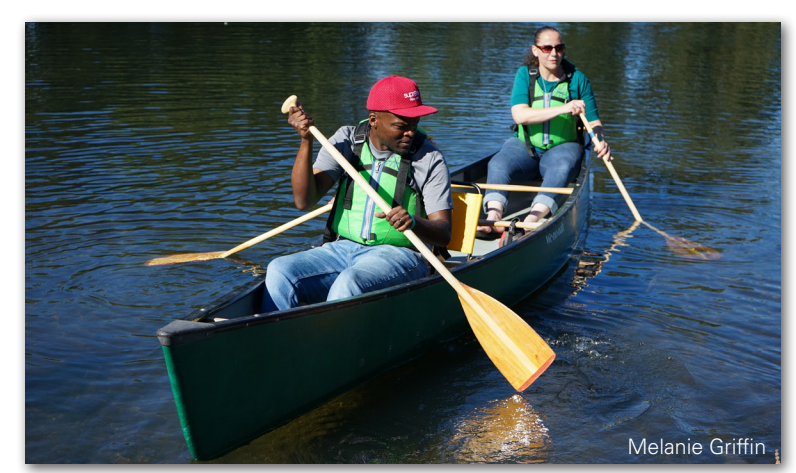
Canoeing at Alton Baker Park

The tourism industry creates revenue for vital city and county needs. Local, state and federal tax revenue generated by visitors to Lane County is $54 million, providing support for local parks, economic development and the arts.