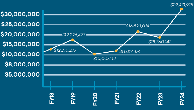
LANE COUNTY LOCAL LODGING TAX COLLECTIONS