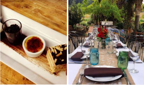
JOEL PALMER HOUSE DAYTON, OREGON VILLA CATALANA SHERWOOD, OREGON

To pioneers, the Willamette Valley was the fertile promised land at the end of the trail. Today, culinary dreamers are taking that legendary bounty and creating artisan food & drink you'll have to taste to believe.