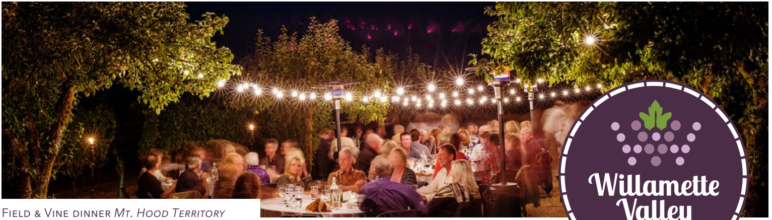
FIELD & VINE DINNER MT. HOOD TERRITORY