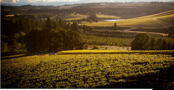
WILLAMETTE VALLEY VINEYARD SALEM, OREGON