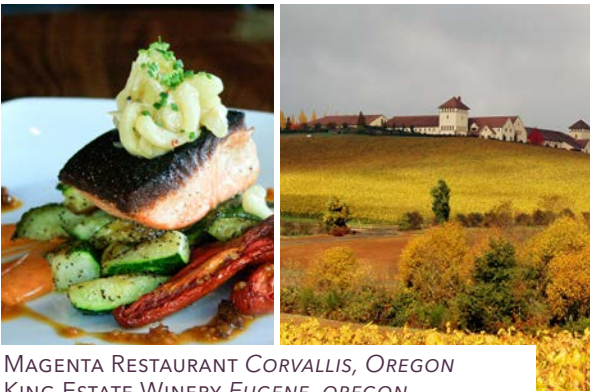
MAGENTA RESTAURANT CORVALLIS, OREGON KING ESTATE WINERY EUGENE, OREGON