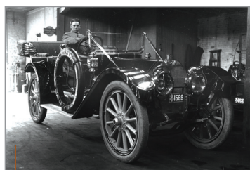
This 1911 Oldsmobile "Limited" was a far cry from the Curved Dash model that inspired "Come away with me Lucille / In my merry Oldsmobile / Down the road of life we'll fly / Automobubbling, you and I."