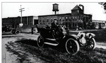
Oldsmobile made cars in Detroit until 1905, when it consolidated its operations in Lansing at the Olds Motor Works, shown here circa 1910.