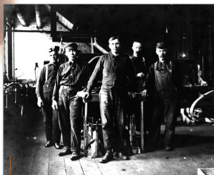
Oldsmobile factory workers in the radiator department, circa 1907-1908.

After fire destroyed the new Olds Motor Works plant in Detroit on March 9, 1901, the Lansing Business Men's Association offered Olds land originally acquired in hopes of permanently hosting the State Fair. He took it. His new plant produced only the curved dash runabout, the first car to be called "Oldsmobile." Ransom Olds left the company in 1904, and General Motors acquired it in 1908. The runabout gave way to new models, and Lansing produced Oldsmobiles until 2001.