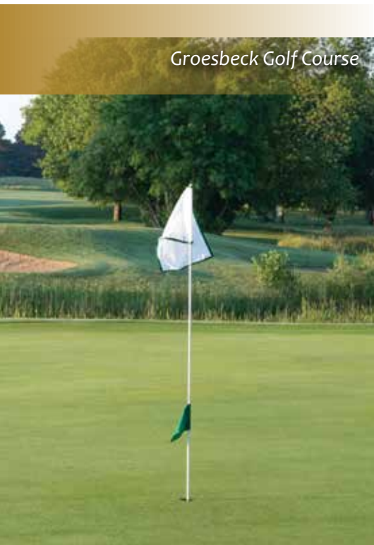
Groesbeck Golf Course