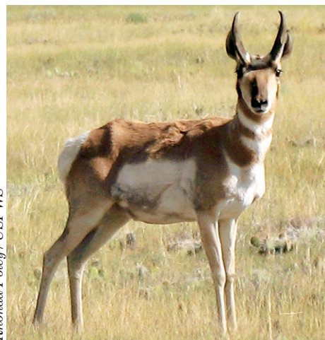
Rhonda Foley / USFWS

Reference: Society for the Study of Amphibians and Reptiles Herpetological Circular No. 39, published 2012 https://ssarherps.org/wp-content/uploads/2014/07/HC_39_7thEd.pdf