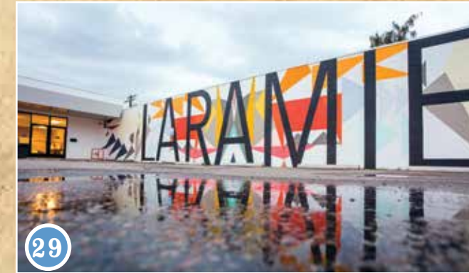
29 ARTIST: June Glasson TITLE: Laramie, 2017 LOCATION: 352 N 3rd St.