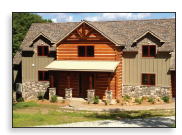
Rustic Ridge at Fern Mountain

This dynamic organization, McCollom Development Strategies, LLC does a wonderful job assisting our local communities to embrace and develop outdoor recreational tourism alongside the culture and heritage of our region. Focusing on building a strong local economy for the future.