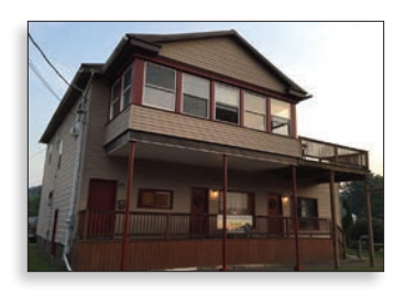
Confluence Guest Rentals

When you walk into the End of the Road Antiques, it's like entering Aladdin's Cave. The shop will captivate any lovers of antiques! Every room is chock-full with a staggering assortment of primitives, vintage wares, collectibles, and antiques.