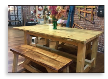
Whistling Duck Furniture

Opened in 2015, Winslow Winery offers visitors an extensive selection of wines to sample and purchase. The winery, located in Perryopolis, invites you to drop by the tasting room at weekends. On warmer days, enjoy the patio with a glass of wine overlooking the vineyard.