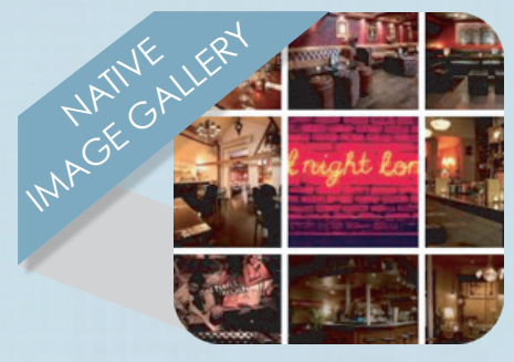
Use the image gallery to display photos to customers, optimized for both Android and iPhone devices.