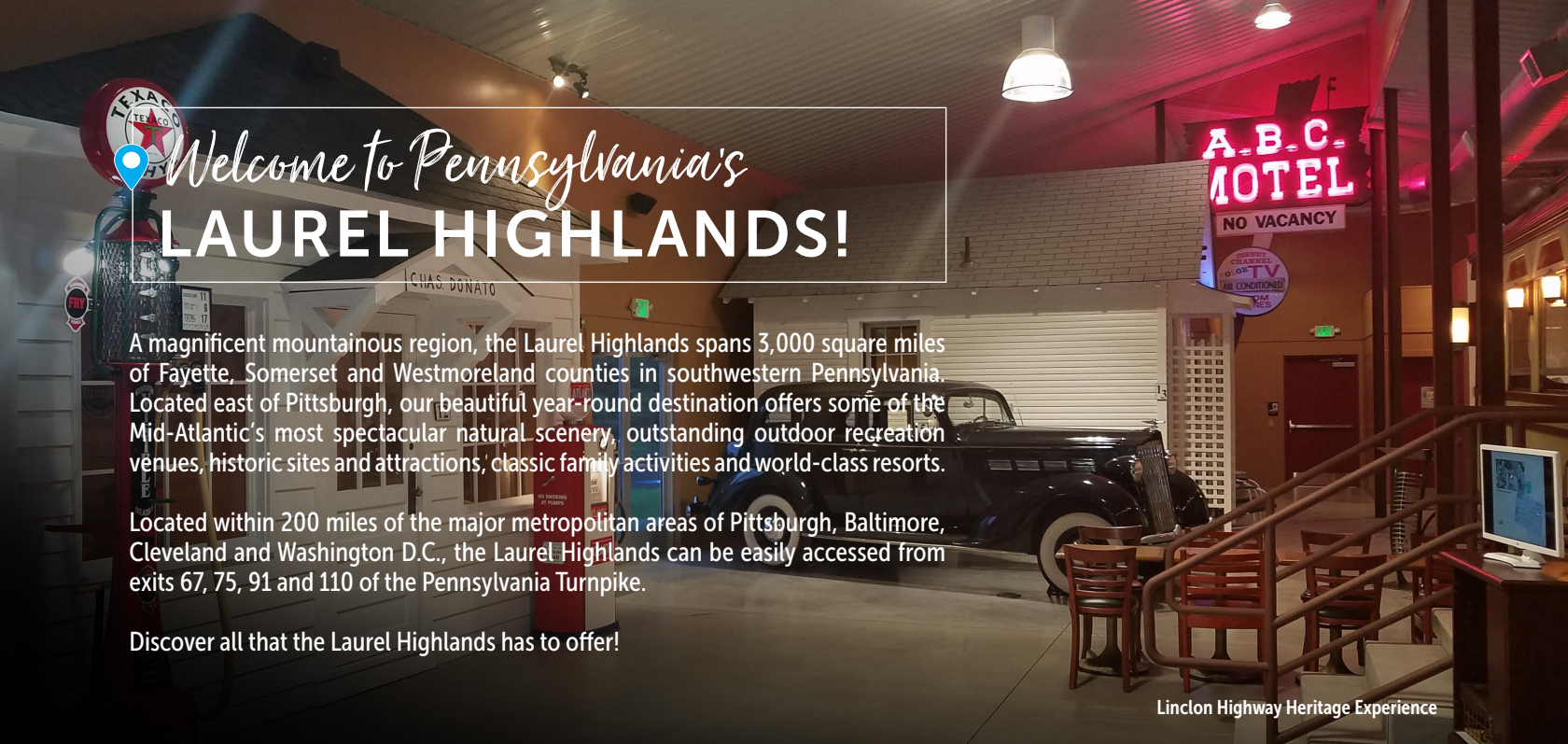
Lincon Highway Heritage Experience