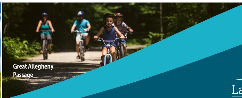
Great Allegheny Passage