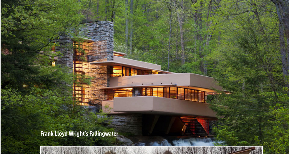
Frank Lloyd Wright's Fallingwater