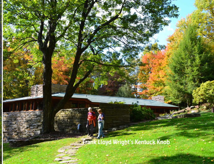
Frank Lloyd Wright's Kentuck Knob