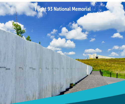
Flight 93 National Memorial