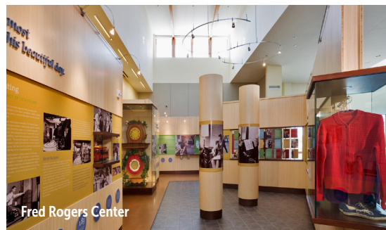
Fred Rogers Center

"It's a beautiful day in the neighborhood. Won't you be, won't you be my neighbor?" Fred Rogers began his PBS children's television show Mister Roger's Neighborhood with this song every weekday from 1968 to 2001, with a total of 895 episodes. Come visit Mr. Rogers' neighborhood in Pennsylvania's Laurel Highlands! Tour the Fred Rogers Center at Saint Vincent College, where you can see artifacts from Mister Rogers' Neighborhood, including his iconic cardigan sweater and tennis shoes. Take a selfie with a statue of Fred in downtown Latrobe, his hometown and birthplace of the banana split. Spend a day at Idlewild & Soak Zone where Daniel Tiger and friends invite you and your kiddos to ride the trolley through the Neighborhood of Make-Believe.