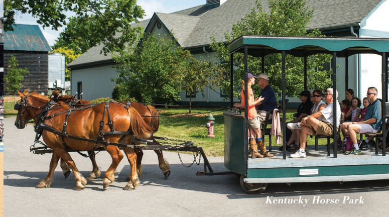
Kentucky Horse Park