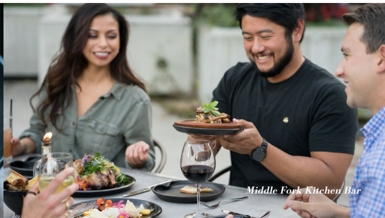
Middle Fork Kitchen Bar