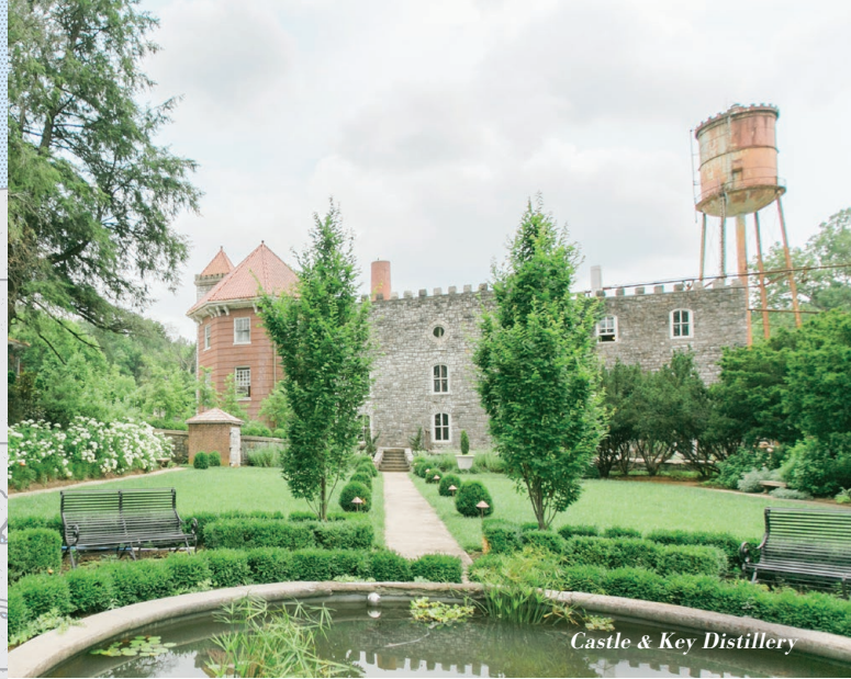
Castle & Key Distillery