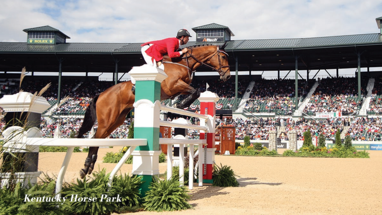
Kentucky Horse Park