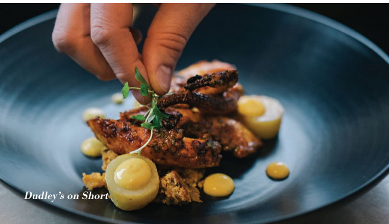
Dudley's on Short

Lexington's fast-growing culinary scene is big, bold and local. Using ingredients sourced from neighboring farms, our local chefs are known for putting twists on classic Southern dishes and cultivating a unique, fresh, farm-to-table experience that has put Lexington on the map as a dining destination. Explore more than 100 locally-owned restaurants and get a taste of the many flavors of Lexington.