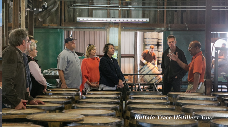
Buffalo Trace Distillery Tour