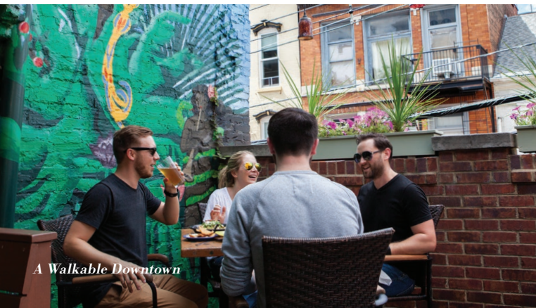
A Walkable Downtown

Meet Lexington. We're located within a day's drive of two-thirds of the U.S. population, with an airport offering 17 direct flights. Here, you get all the amenities of a big city with that genuine, southern hospitality we're known for. Our downtown is completely walkable, saving money on transportation and giving you more freedom to explore. As the Horse Capital of the World and the Birthplace of Bourbon, you'll love every minute you spend here—before, during and after your event.