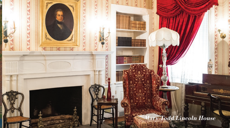
Mary Todd Lincoln House