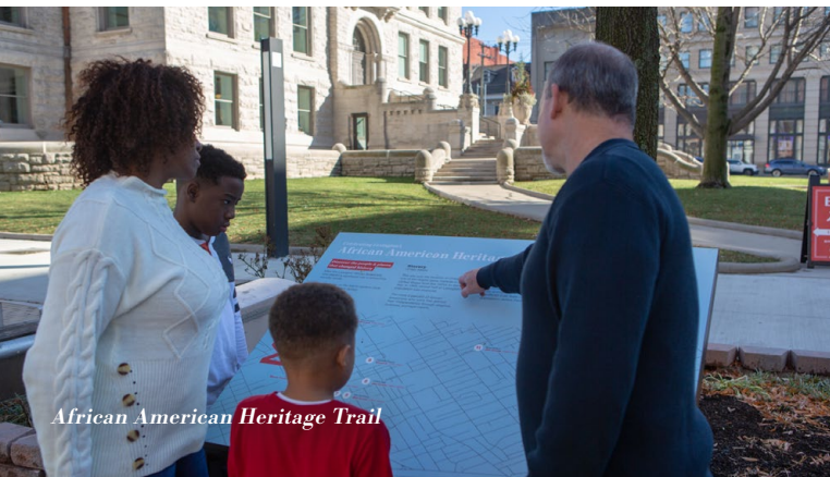
African American Heritage Trail

Explore the rich history of Lexington's Bluegrass region by touring the homes of prominent historical figures, visiting preserved Civil War sites honoring Kentucky's heritage, or discovering the garden and architectural gems hidden around downtown Lexington.