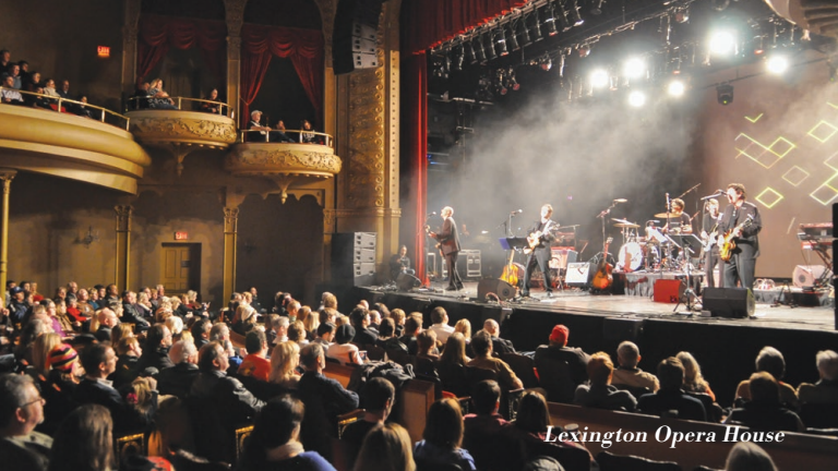
Lexington Opera House