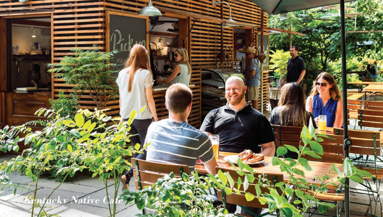
Kentucky Native Cafe