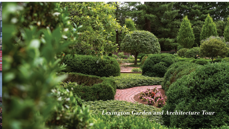
Lexington Garden and Architecture Tour