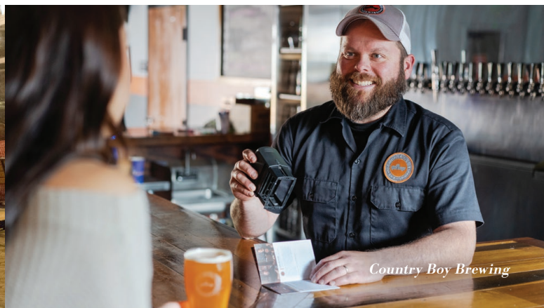
Country Boy Brewing