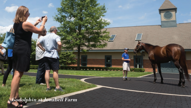
Godolphin at Jonabell Farm