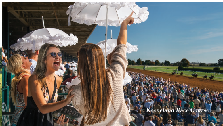
Keeneland Race Course