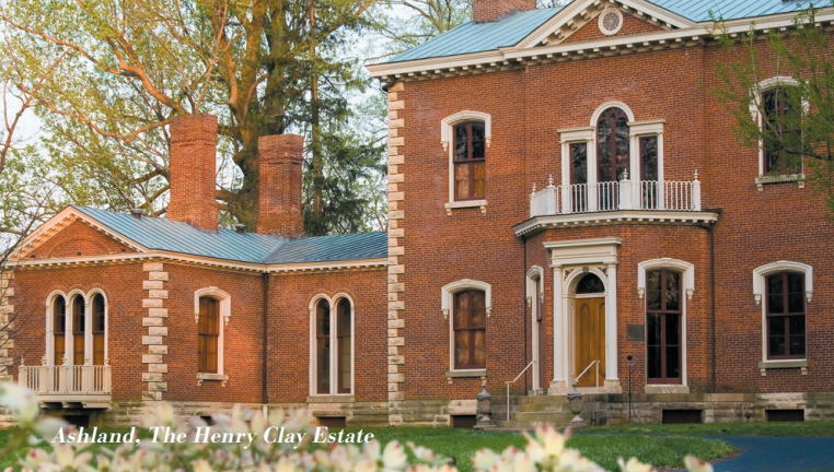
Ashland, The Henry Clay Estate