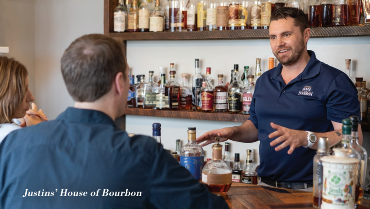
Justin's House of Bourbon