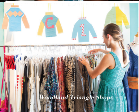
Woodland Triangle Shops