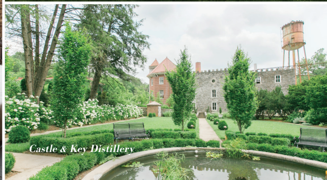
Castle & Key Distillery