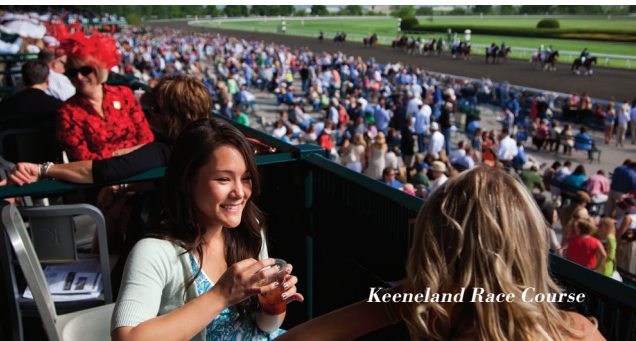
Keeneland Race Course

To market and promote Lexington's Bluegrass Region for the purpose of attracting visitors and growing the economy.