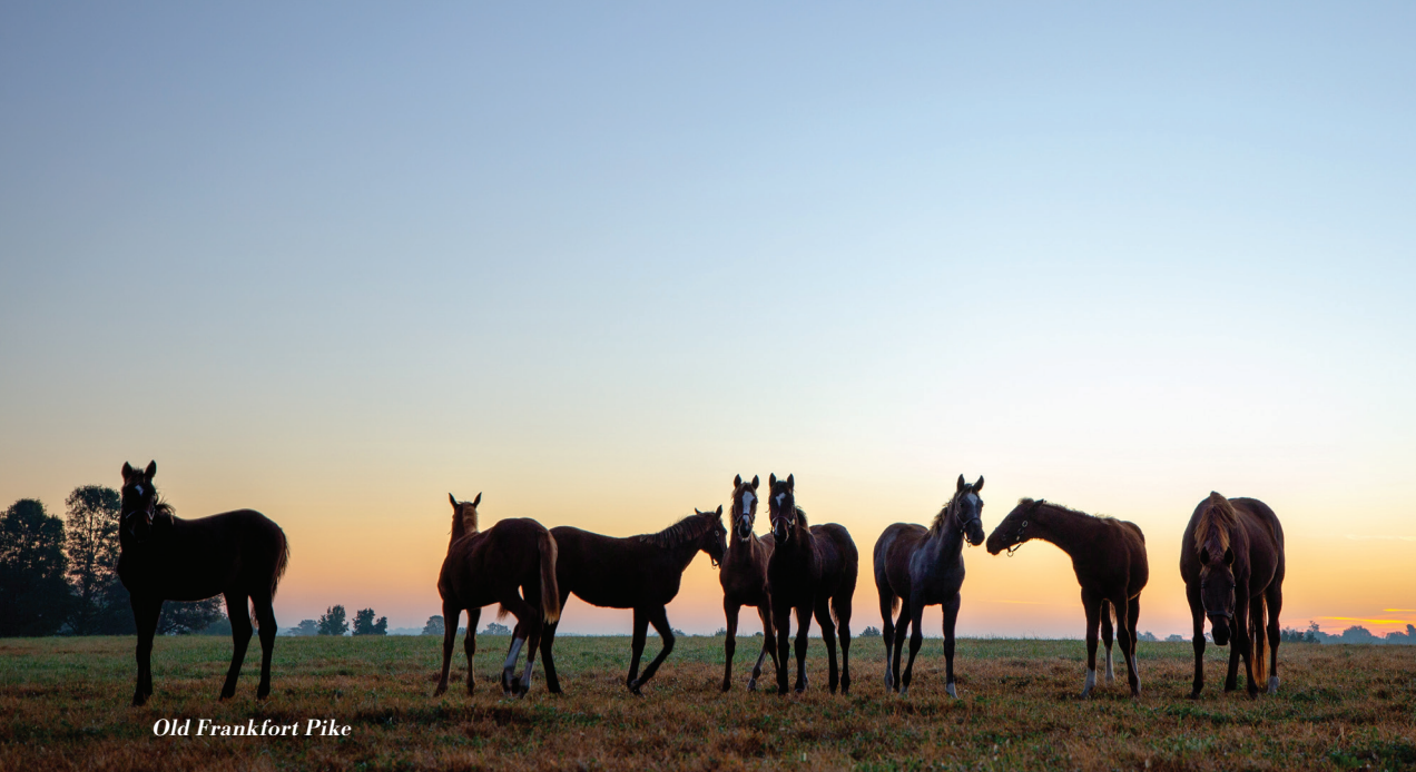
Old Frankfort Pike