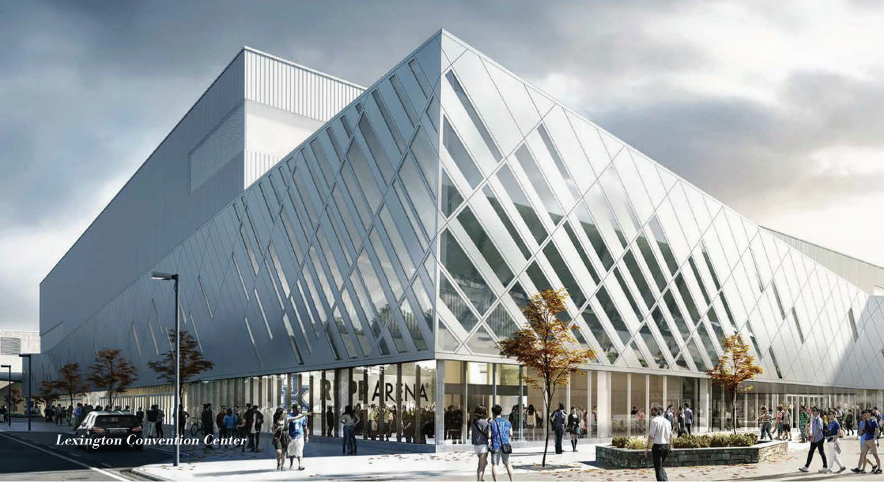
Lexington Convention Center