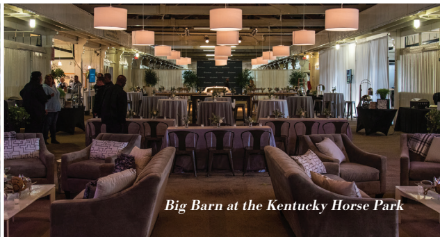
Big Barn at the Kentucky Horse Park