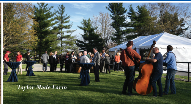
Taylor Made Farm