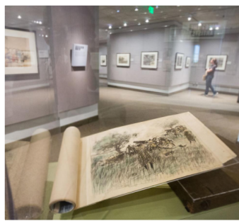
John J. Pershing Exhibit