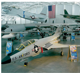
Strategic Air Command & Aerospace Museum