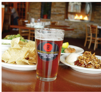
Lazlo's Brewery & Grill