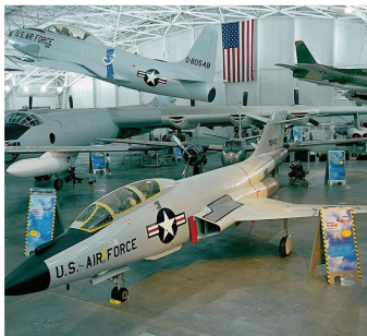
Strategic Air Command & Aerospace Museum