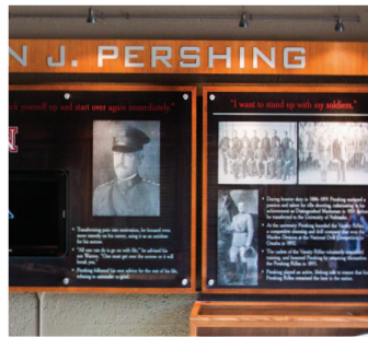
John J. Pershing Exhibit