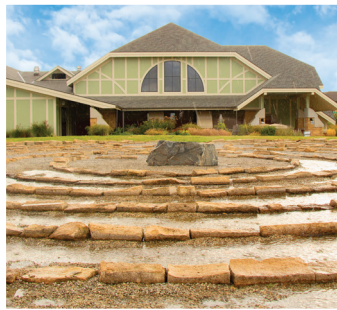
Trinity United Methodist Church