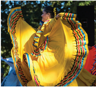
Nebraska Hispanic Festival