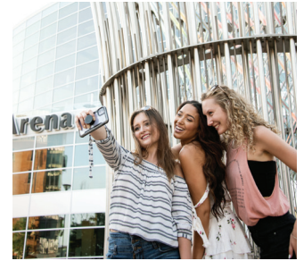
Pinnacle Bank Arena