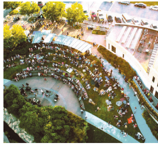
Concert in the Park