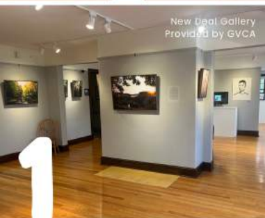
New Deal Gallery