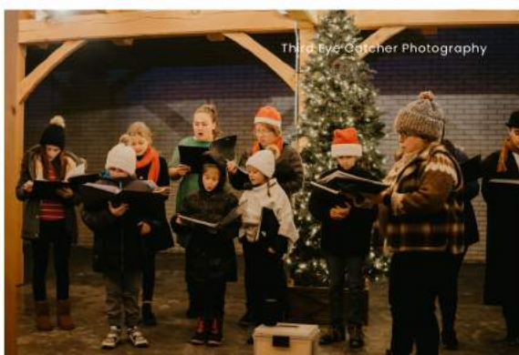
Third Eye Catcher Photography