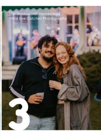
The Wadsworth Homestead Third Eye Catcher Photography