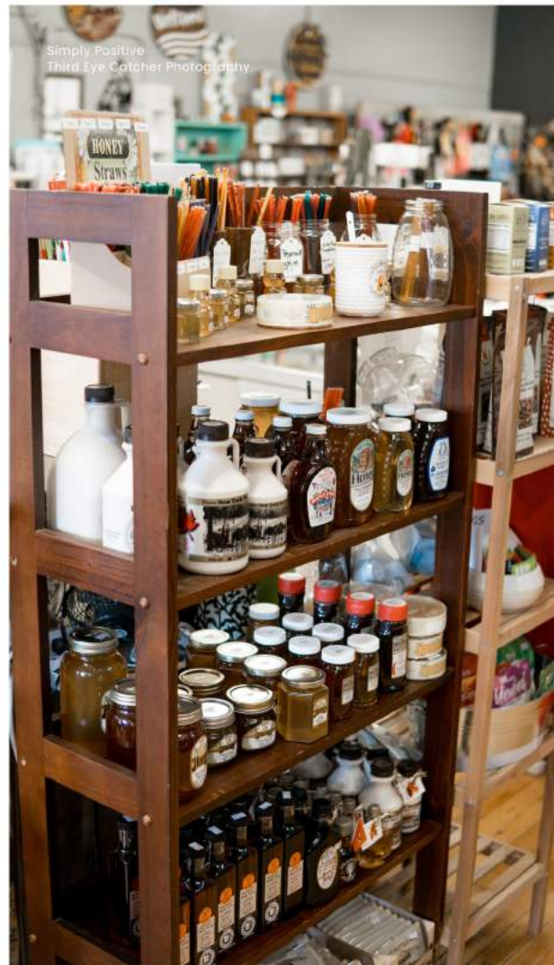
Simply Positive Third Eye Catcher Photography