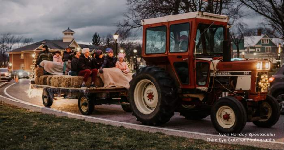
Avon Holiday Spectacular