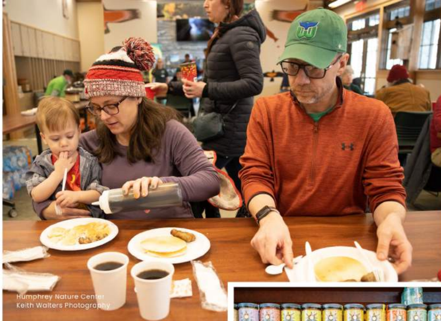
Humphrey Nature Center Keith Walters Photography