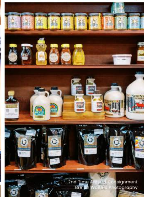
2nd Time Around Consignment