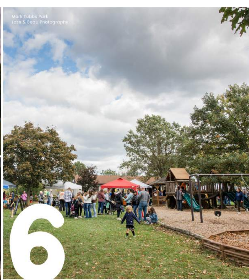
Mark Tubbs Park