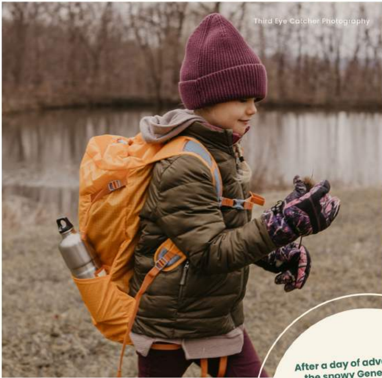
Third Eye Catcher Photography