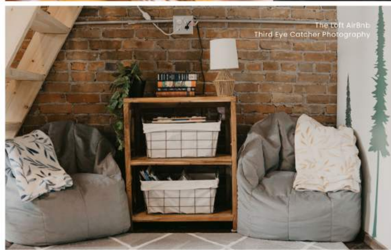
The Loft Airbnb