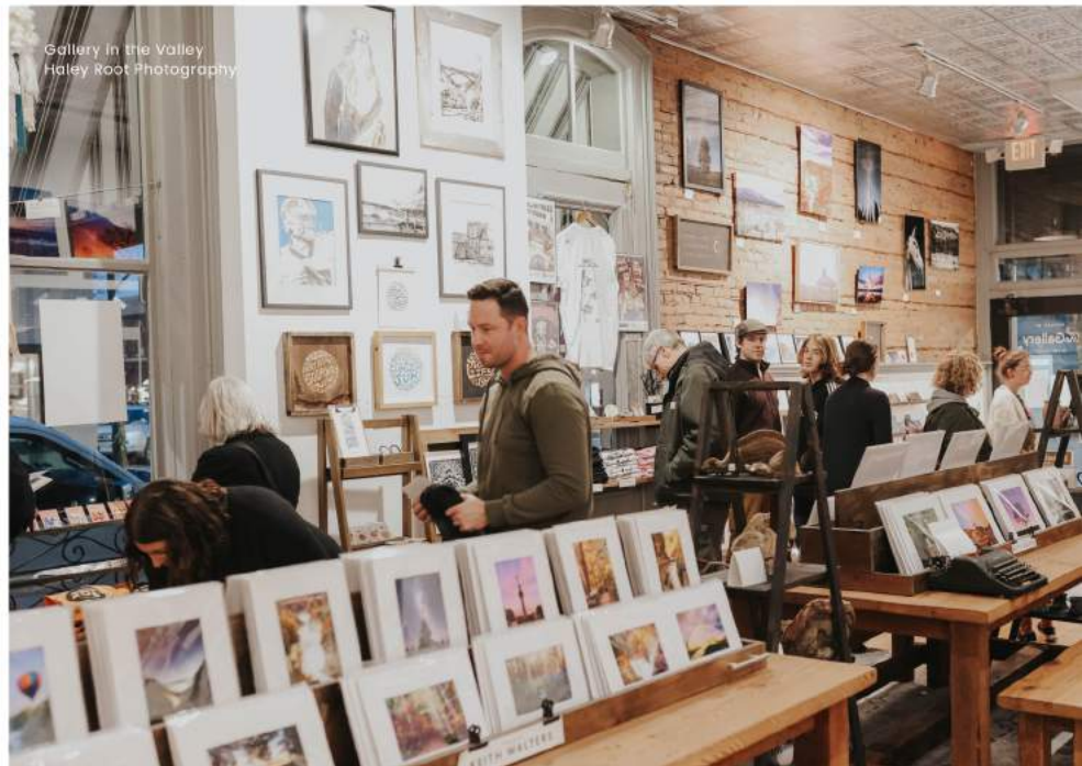
Gallery in the Valley