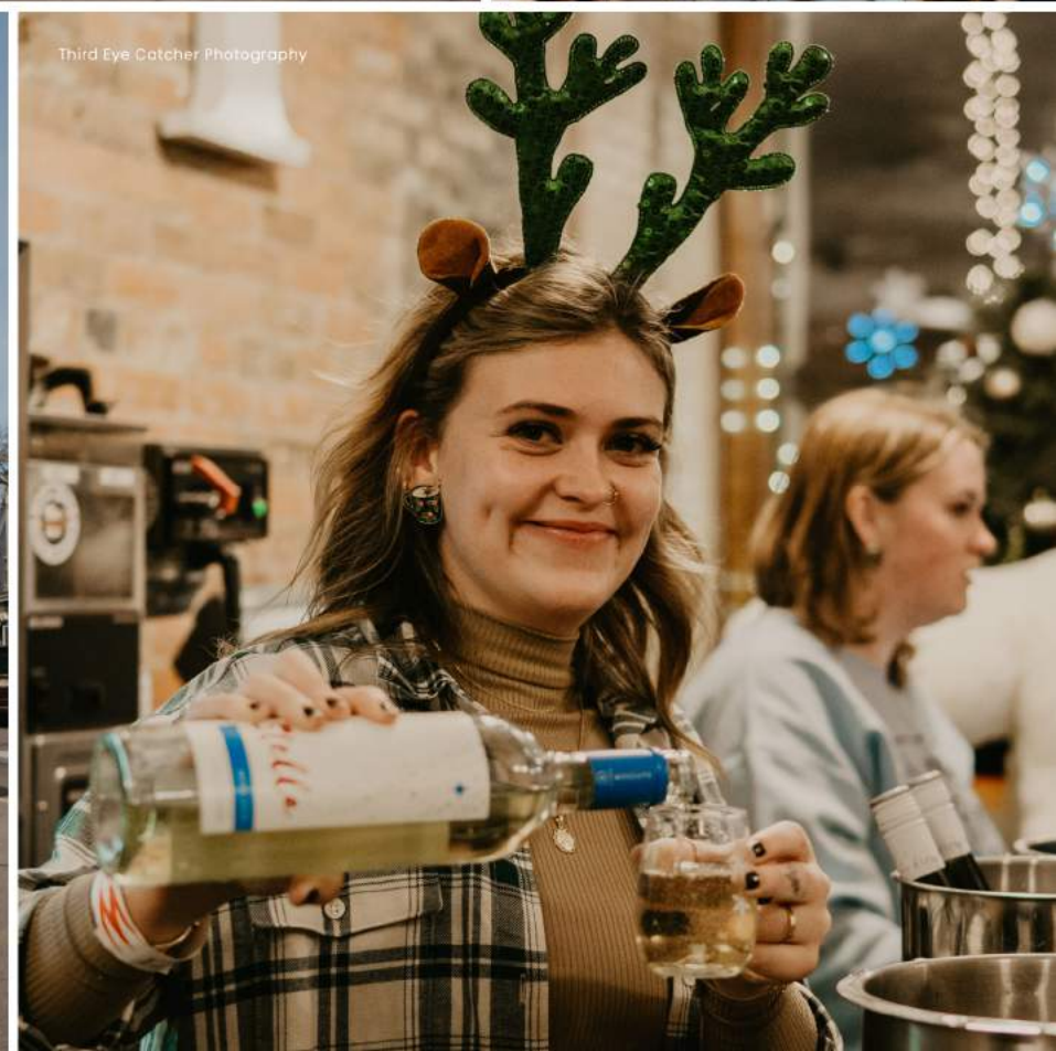
Third Eye Catcher Photography