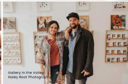
Gallery in the Valley Haley Root Photography