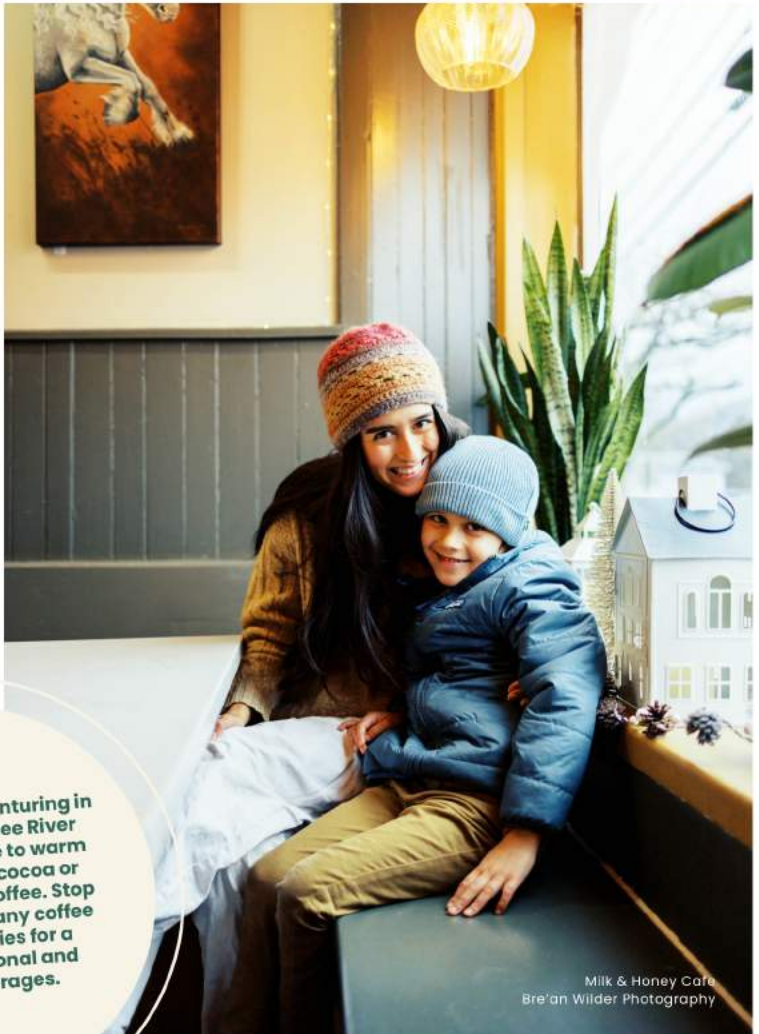
Milk & Honey Cafe

After a day of adventuring in the snowy Genesee River Valley, make sure to warm up with a cup of cocoa or freshly-brewed coffee. Stop into one of our many coffee shops or bakeries for a variety of seasonal and holiday beverages.