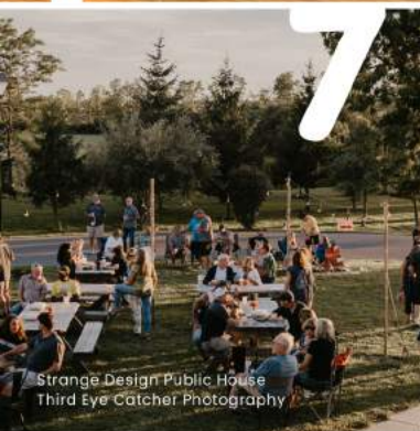
Strange Design Public House

These events only scratch the surface of all the fun happening in LivCo in celebration of the eclipse. For everything you might need to plan the ultimate eclipse-viewing experience, be sure to visit livcosol.com .