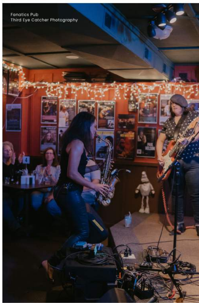
Fanatics Pub Third Eye Catcher Photography