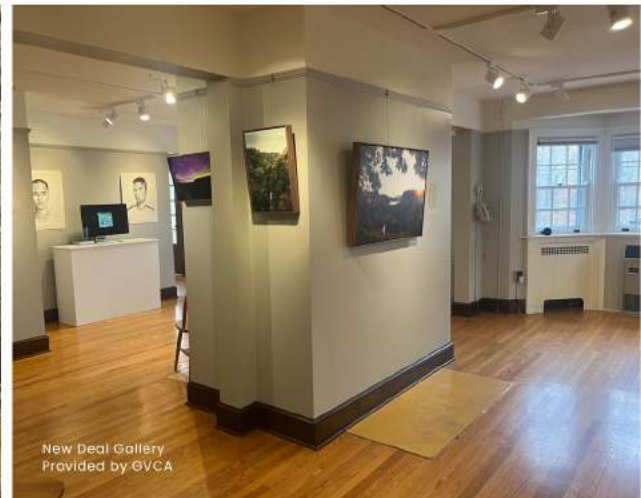
New Deal Gallery