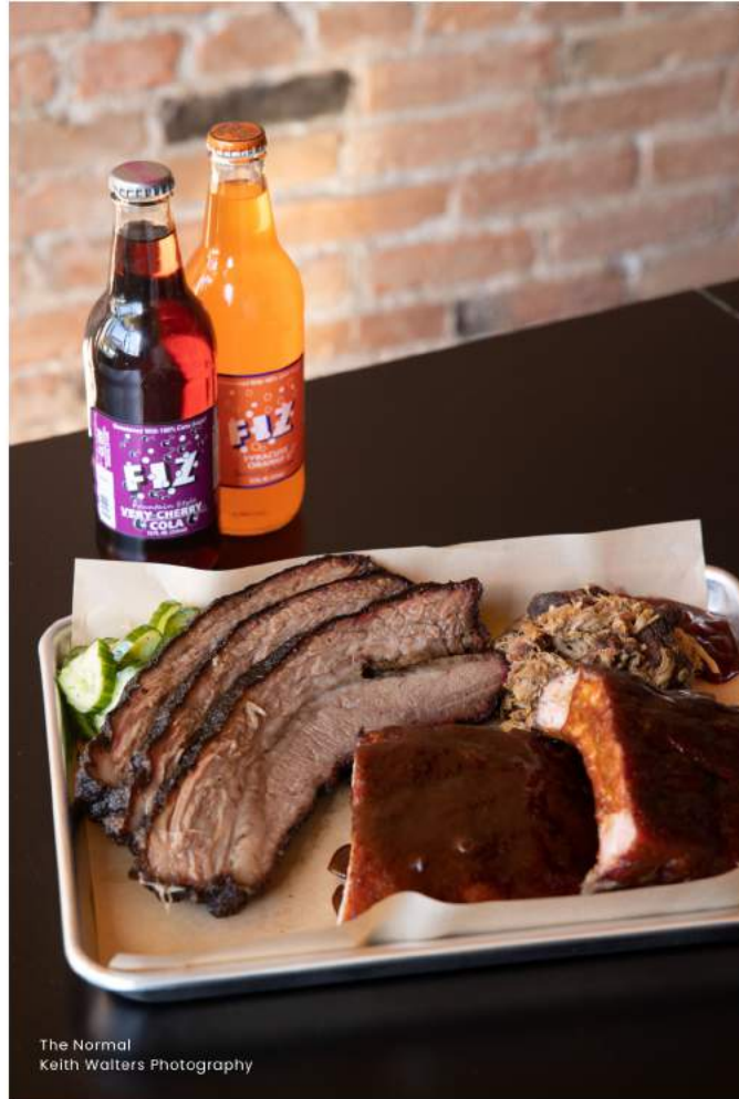
The Normal Keith Walters Photography

You can't visit Lima without experiencing the village's amazing live music scene. Catch some live blues and jazz at Fanatics Pub , where a cozy, intimate side room features musicians from throughout the country.