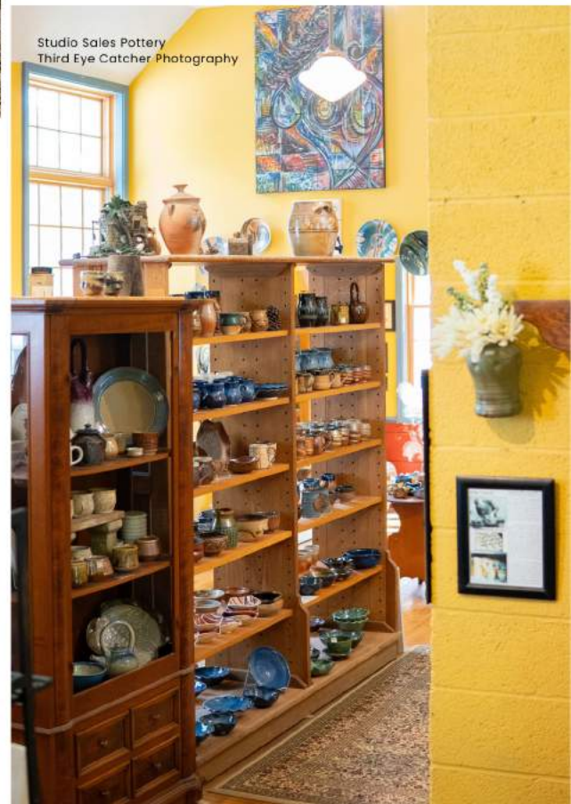
Studio Sales Pottery Third Eye Catcher Photography