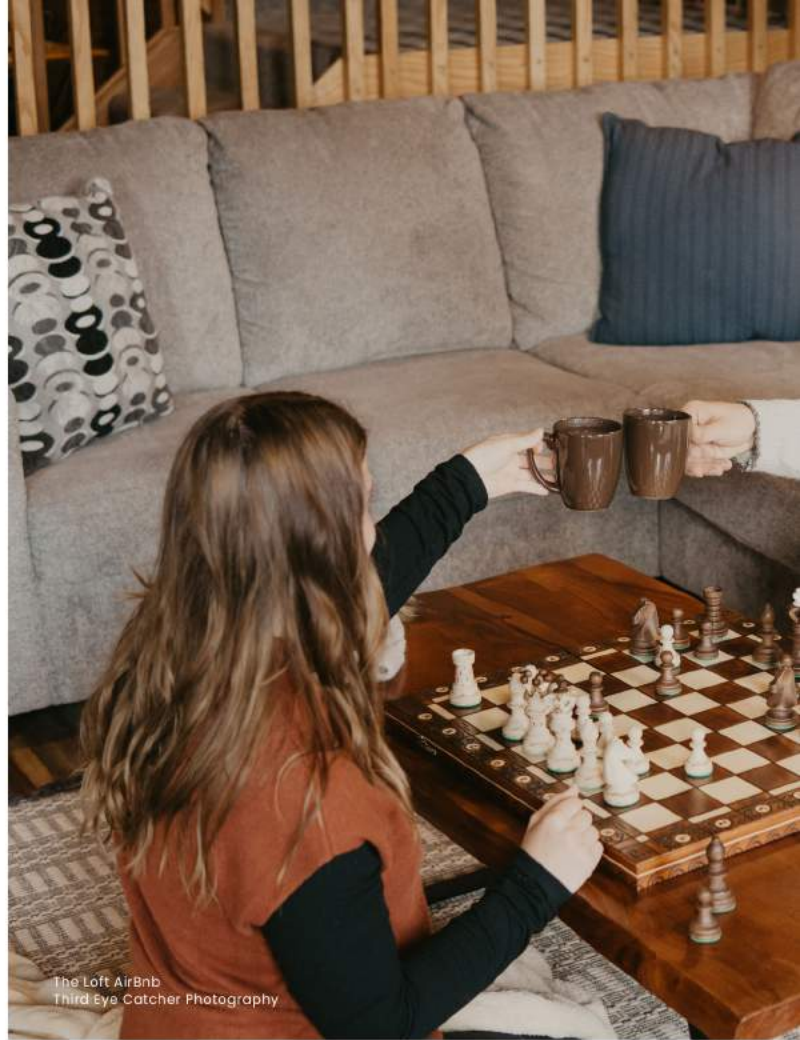
The Loft Airbnb

Not sure where to get started? We have a few ideas. Here's how we recommend you spend a perfect, three-day getaway in LivCo this winter.