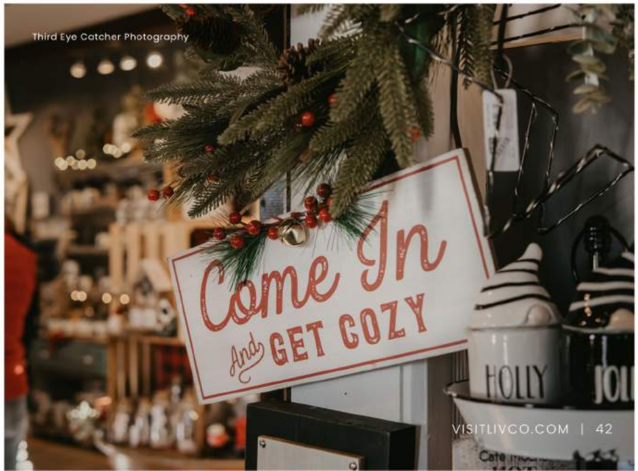
Third Eye Catcher Photography