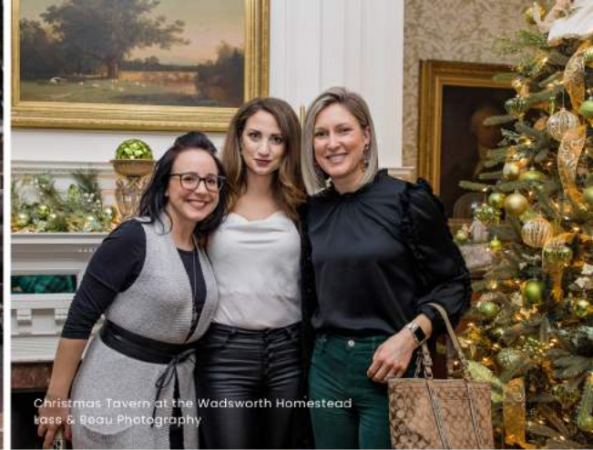
Christmas Tavern at the Wadsworth Homestead