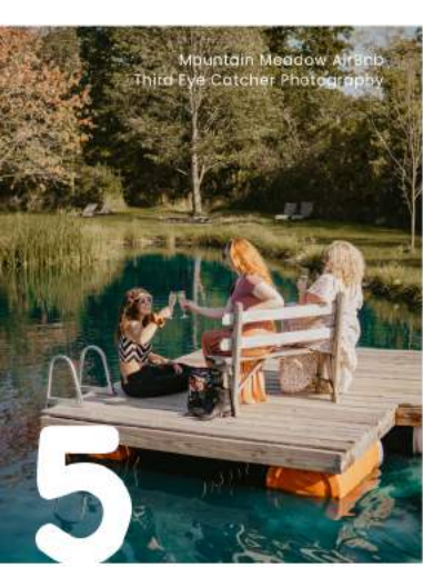
Mountain Meadow Airbnb