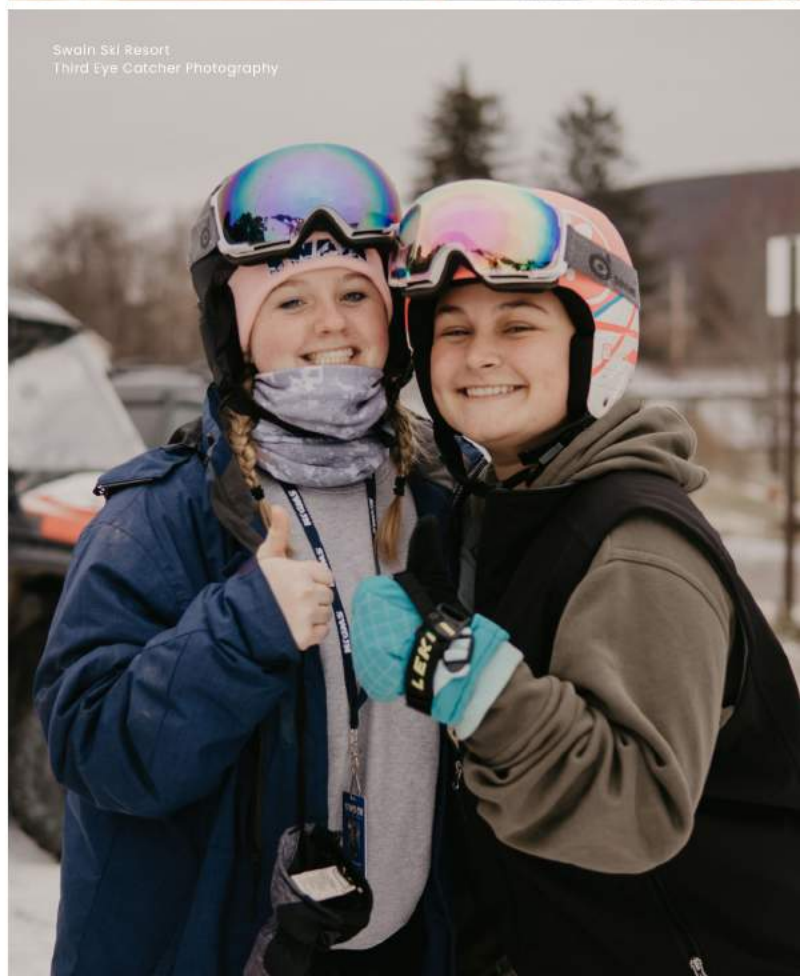
Swain Ski Resort