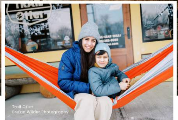
Trail Otter