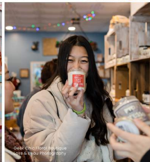
Geek Chic Floral Boutique