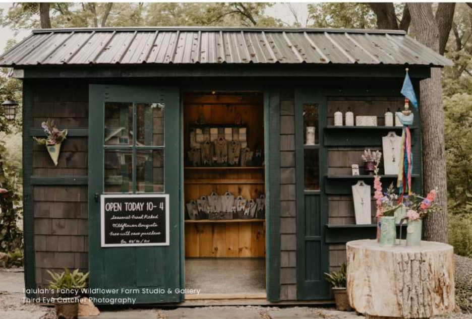
Talulah's Fancy Wildflower Farm Studio & Gallery Third Eye Catcher Photography

Don't quite want to get your hands messy? Stop in anyway to shop the beautiful handmade pottery, made by all New York artists, and be sure to check out the historic grounds while you're there. The gallery is located within a one-room schoolhouse originally built in 1853.