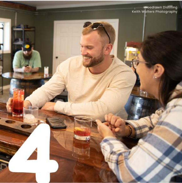
Woodlawn Distilling