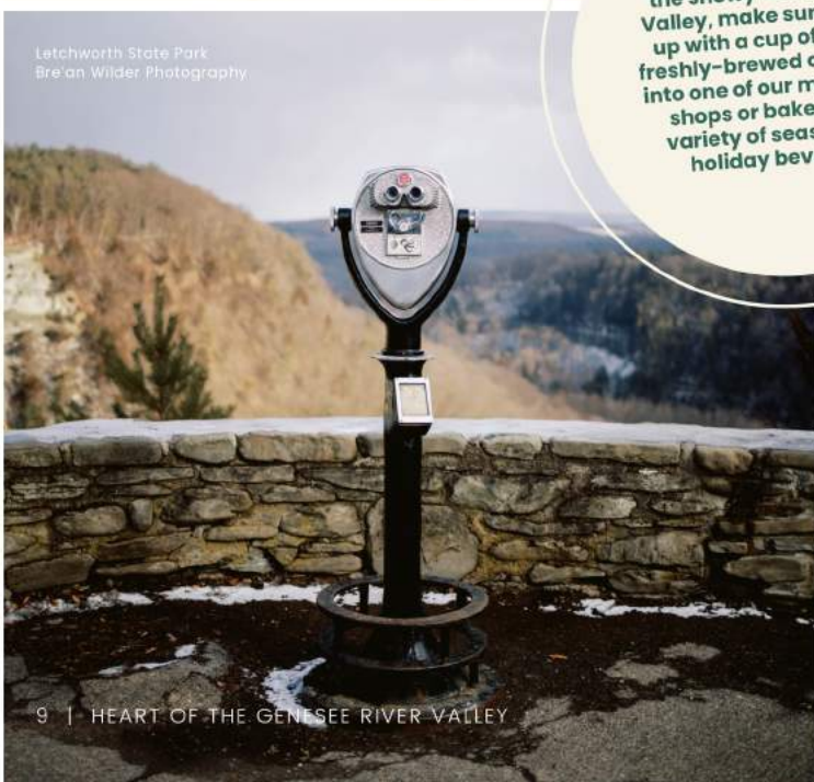
Letchworth State Park

After a day of adventuring in the snowy Genesee River Valley, make sure to warm up with a cup of cocoa or freshly-brewed coffee. Stop into one of our many coffee shops or bakeries for a variety of seasonal and holiday beverages.