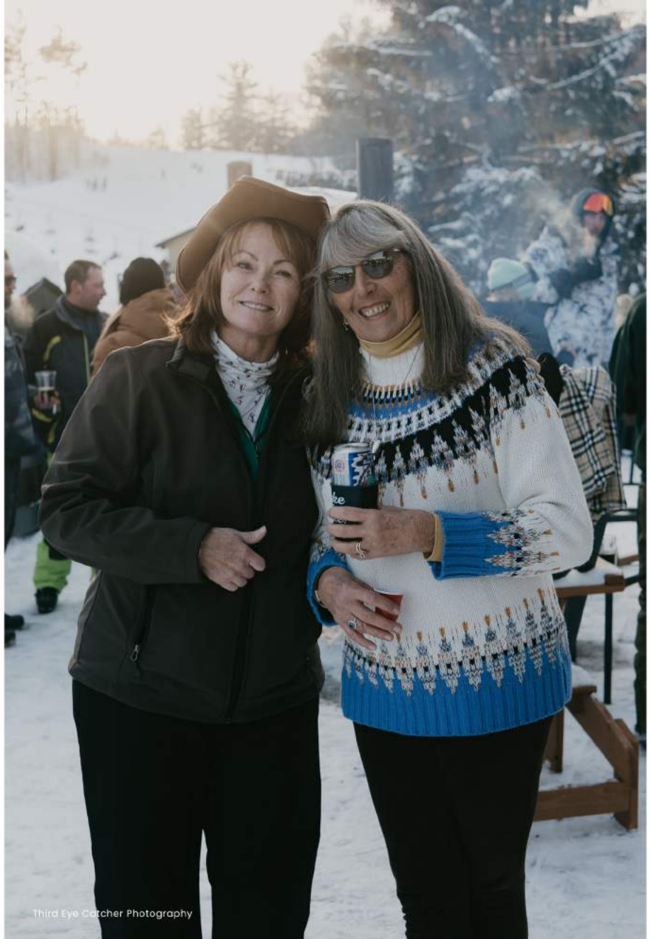
Third Eye Catcher Photography