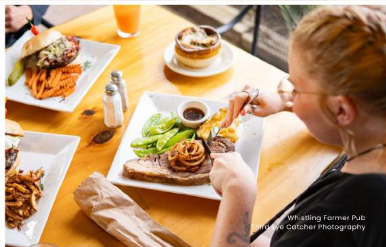
Whistling Farmer Pub

After you've worked up an appetite, enjoy a taste of LivCo at the Whistling Farmer Pub in Nunda. This eatery focuses on all things farm-fresh and locally sourced, with a menu filled with gastropub fare and American favorites. Ingredients are sourced close by, and any vegans or vegetarians in your group are sure to find lots to love.