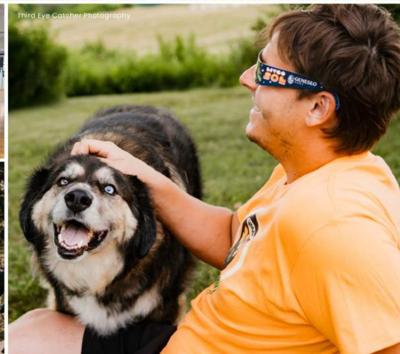
Third Eye Catcher Photography