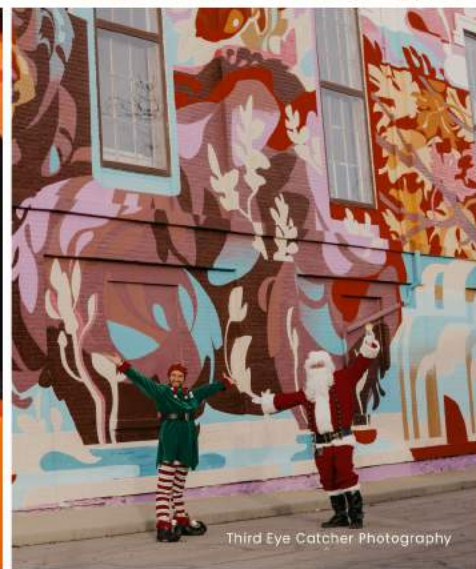
Third Eye Catcher Photography