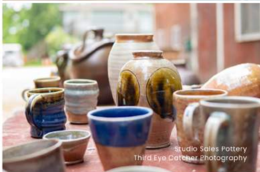
Studio Sales Pottery Third Eye Catcher Photography