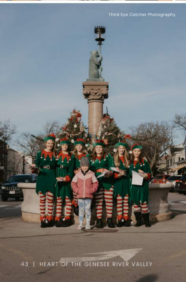
Third Eye Catcher Photography