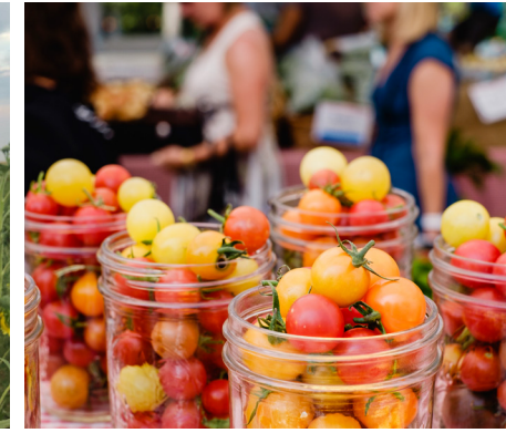
Photos left to right: Ya Ya Farm & Orchard, looking west to the mountains, Bee Hugger Farm, Lone Hawk Farm, Bee Hugger Farm, Boulder Farmers Market