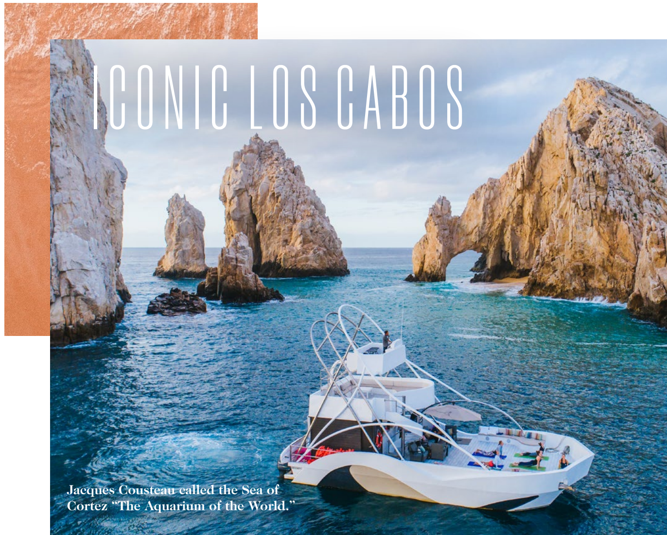
Jacques Cousteau called the Sea of Cortez "The Aquarium of the World."

In a destination where we value nature, nurture sustainable growth and believe in quality over quantity, there is truly something for everyone to enjoy.