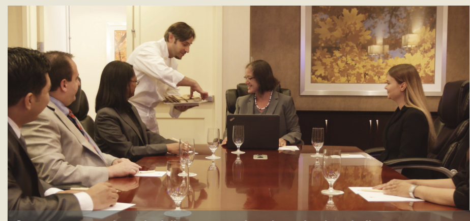
Our partners consistently deliver expectation-shattering hospitality.