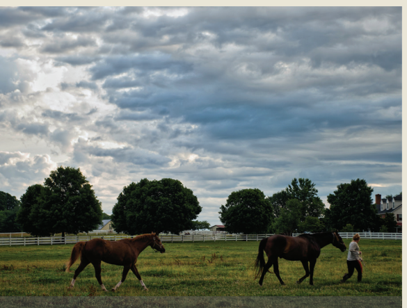
Loudoun County is home to over 15,000 horses.