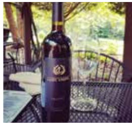
@annaliisa_000 The Vineyards & Winery at Lost Creek