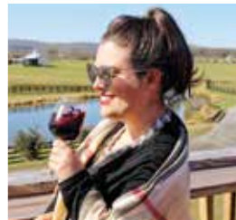
@eastcoastcontessa Winery 32