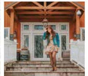
@onceuponahain Sunset Hills Vineyards