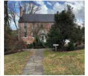
Zephaniah Farm Vineyard