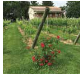
@wineputsimply Crushed Cellars