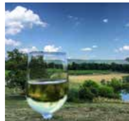
@realclara Notaviva Craft Fermentations