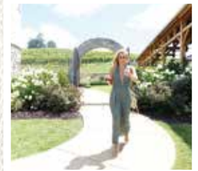
@sjcollie Creek's Edge Winery