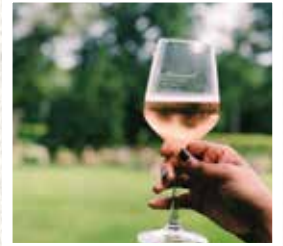
@dctravelgirl Fleetwood Farm Winery