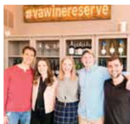
@thegrapepair The Wine Reserve at Waterford