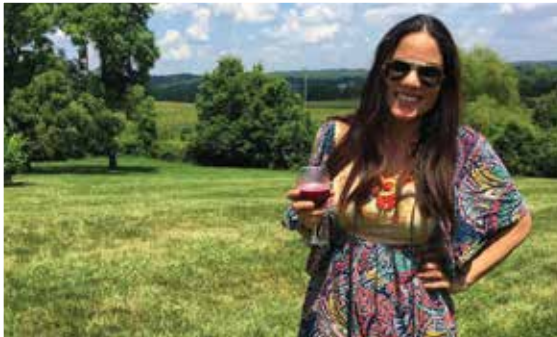
@bewhatwelove Quattro Gomba's Winery