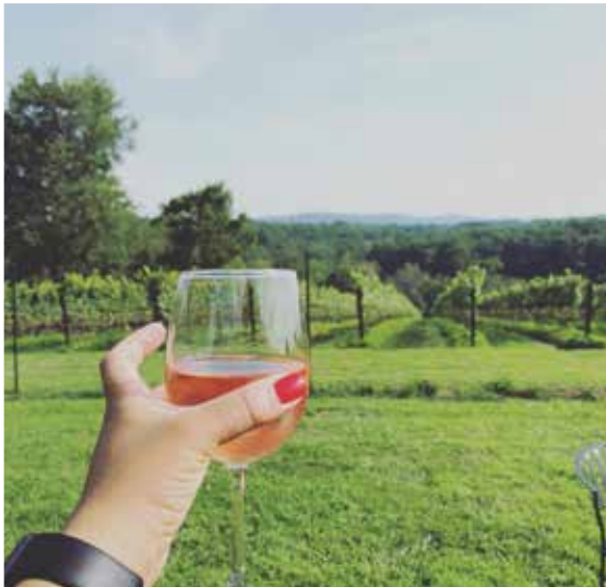
@winedinetravel365 Cana Vineyards and Winery of Middleburg