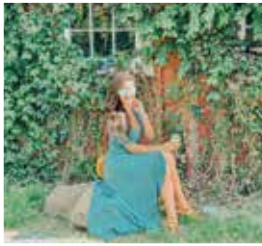
@flamingofotoun Hunters Run Winery