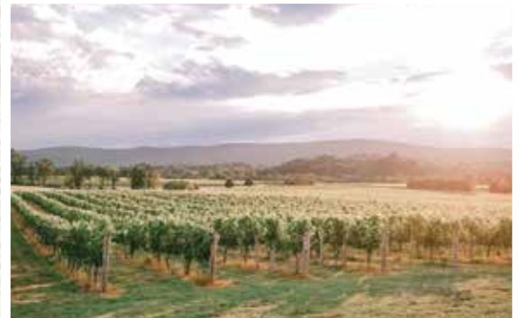
@photographydujour Breaux Vineyards