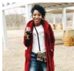
@lindsaybradams 50 West Vineyards