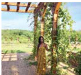
Chrysalis Vineyards at The Ag District