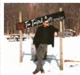
@nickolasbarylski Two Twisted Posts Winery