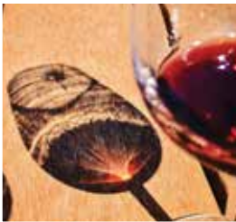
@chasingthevagrapes Boxwood Estate Winery