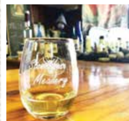
@dc_barscene Stonehouse Meadery