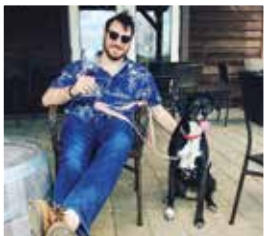
@bordeauxwithbae 8 Chains North Winery