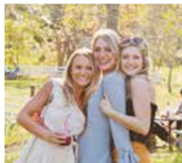
Dry Mill Vineyard & Winery