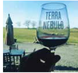
@bordeauxwithbae Terra Nebulo Vineyards