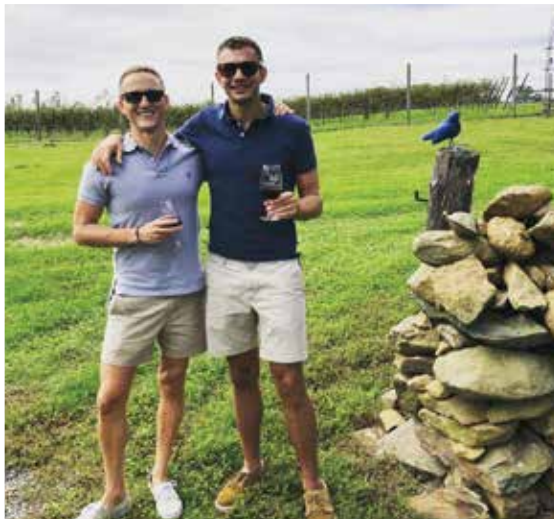
@outofficeboys 868 Estate Vineyards