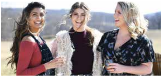
@ashpaigephot Greenhill Winery & Vineyards