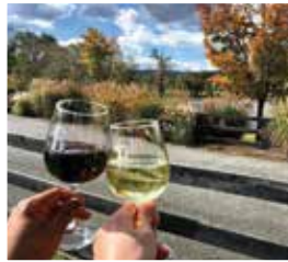
@sloya72 Bogati Winery