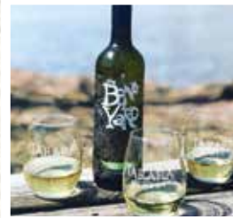
@practicallyclassy Tarara Winery