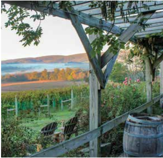
Hillsborough Vineyards & Brewery