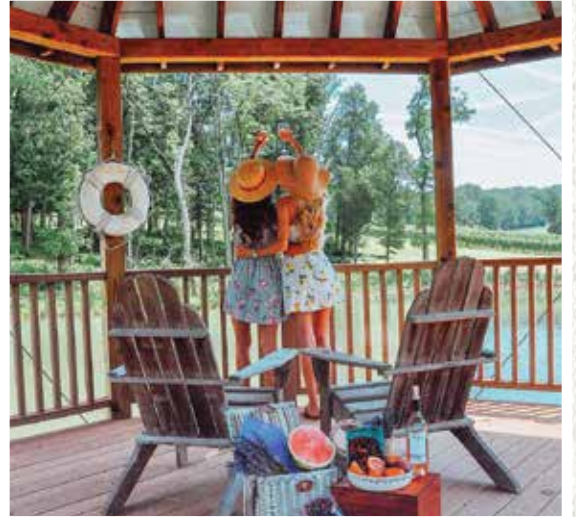
@flamingofotoun Casanel Vineyards and Winery