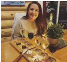
@lauchrtay Hidden Brook Winery