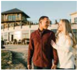
@alee_703 Stone Tower Winery