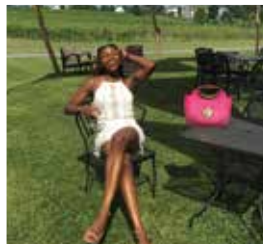
@suis_elegante Fabbioni Cellars