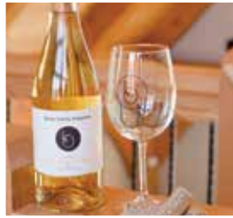
@l.k.m.photography Bozzo Family Vineyards