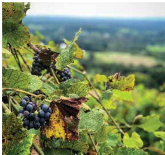
@capitalrunnergirl Bluemont Vineyard