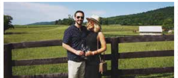
@livpggh Doukenie Winery