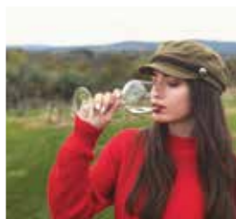
@veronika_simon Corcoran Vineyards & Cidery

Make Your Winery Visit Perfect with a Gourmet Picnic from Virginia Picnic Basket!