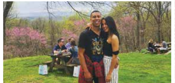
@ncrayton20 Willowcroft Farm Vineyards