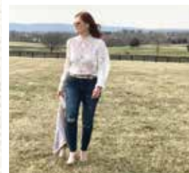
@bonchicstyle Village Winery