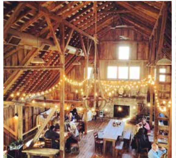
@visitloudoun The Barns At Hamilton Station