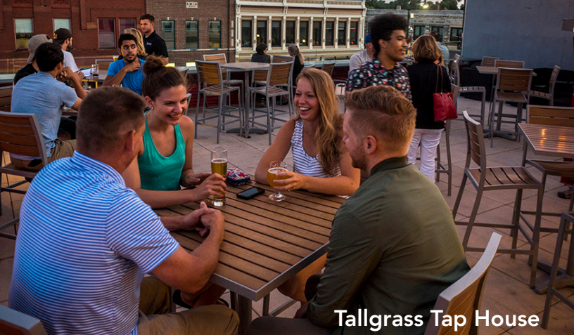
Tallgrass Tap House

Find juicy burgers, Jamaican inspired dishes, sizzling fajitas and more all throughout Manhattan. Discover unfamiliar dishes and a twist to familiar flavors. Sit on the porch and overlook the local winery as you sip locally made wine and cider or venture to the local microbrewery in the downtown district. No matter your taste, no matter your mood Manhattan has something to satisfy your appetite.