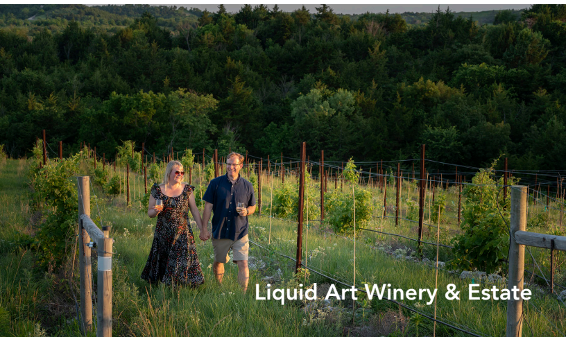
Liquid Art Winery & Estate

Find juicy burgers, Jamaican inspired dishes, sizzling fajitas and more all throughout Manhattan. Discover unfamiliar dishes and a twist to familiar flavors. Sit on the porch and overlook the local winery as you sip locally made wine and cider or venture to the local microbrewery in the downtown district. No matter your taste, no matter your mood Manhattan has something to satisfy your appetite.