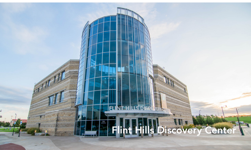
Flint Hills Discovery Center

The very spirit of Oh Manhattan! moments live with great vitality in the many vibrant activities to do throughout town. Enjoy an afternoon of learning about the unique landscape at the Flint Hills Discovery Center, or soar above the tree tops at Wildwood Adventure Park. Check out the unique automotive collection that includes over 65 vehicles, from exotic cars to classics. There's something to do around every corner.