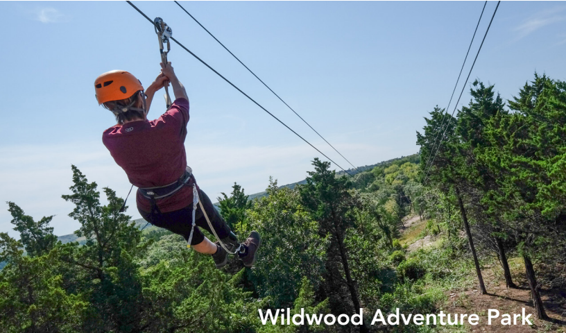
Wildwood Adventure Park

The very spirit of Oh Manhattan! moments live with great vitality in the many vibrant activities to do throughout town. Enjoy an afternoon of learning about the unique landscape at the Flint Hills Discovery Center, or soar above the tree tops at Wildwood Adventure Park. Check out the unique automotive collection that includes over 65 vehicles, from exotic cars to classics. There's something to do around every corner.