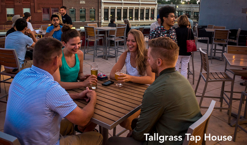
Tallgrass Tap House

Find juicy burgers, Jamaican inspired dishes, sizzling fajitas and more all throughout Manhattan. Discover unfamiliar dishes and a twist to familiar flavors. Sit on the porch and overlook the local winery as you sip locally made wine and cider or venture to the local microbrewery in the downtown district. No matter your taste, no matter your mood Manhattan has something to satisfy your appetite.