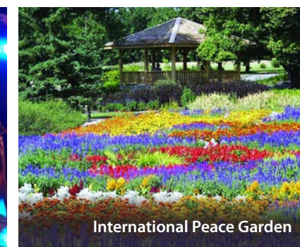
International Peace Garden