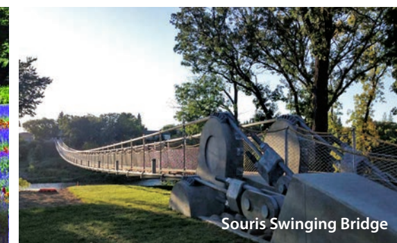
Souris Swinging Bridge