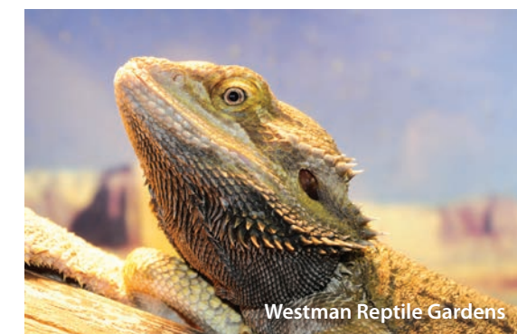
Westman Reptile Gardens

The Westman region welcomes a relatively equal number of visitors all year long. The spring and summer months are the most popular, as visitation in April to June is 25% and July to September is 31% , followed by October to December at 24% and January to March at 20% .