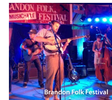
Brandon Folk Festival