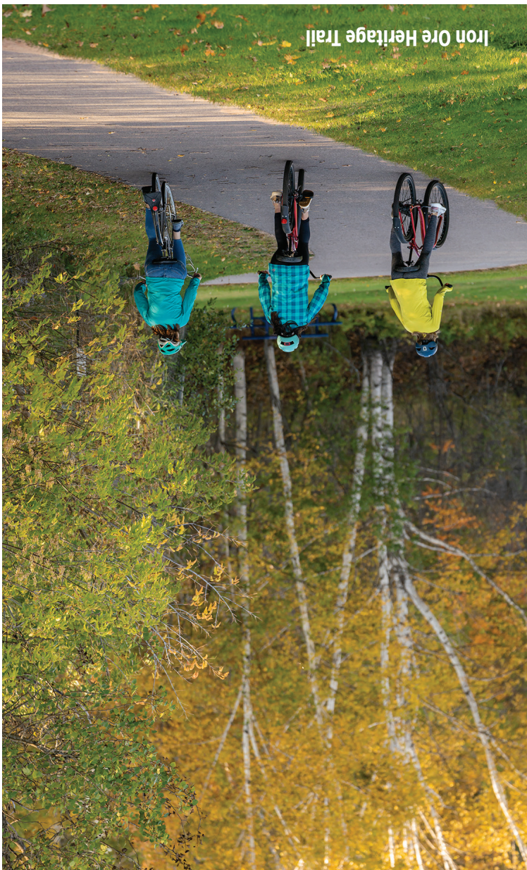
Iron Ore Heritage Trail