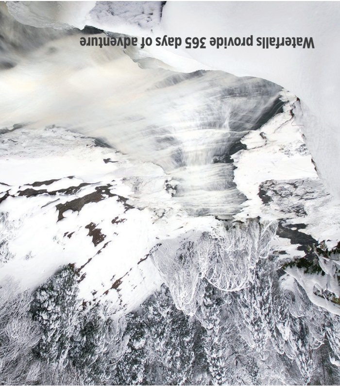
Waterfalls provide 355 days of adventure

architecture of Marquette, Ishpeming and Negaunee. Presque Isle Park and incorporated into the historic brown sedimentary rock can be seen in the cliffs of as recently as 600 million years ago. The red- is Jacobsville Sandstone, which may have formed The youngest rock type in Marquette County region's geology.