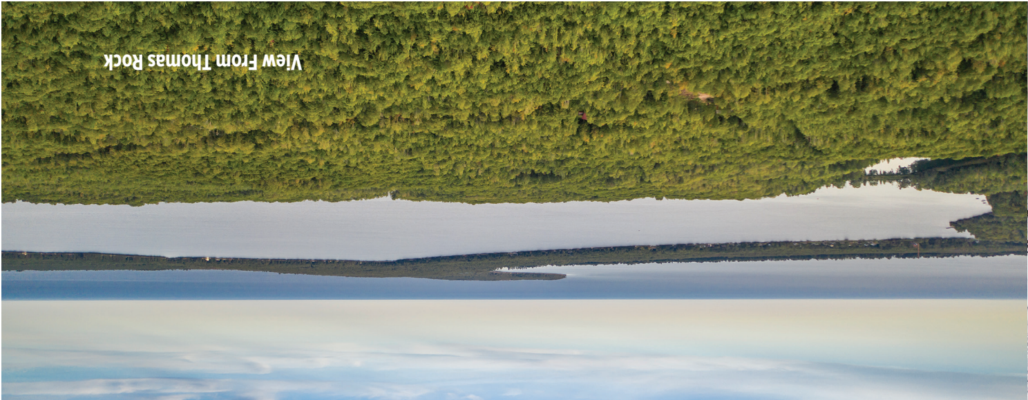
View From Thomas Rock