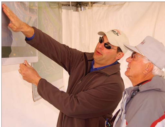
The Mat-Su CVB board and staff hosted a "Gateway Gathering" to educate the public about the Gateway Visitor Center project.

Staff attended meetings of local chambers and business organizations to communicate bureau announcements and events. These organizations included the Alaska Travel Industry Association, Alaska State Fair, Alaska's Mat-Su Bed