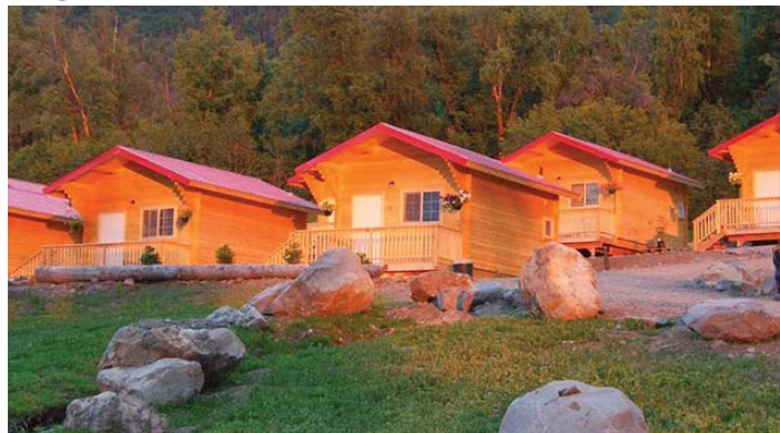
Knik River Lodge is located at the end of Knik River Road.