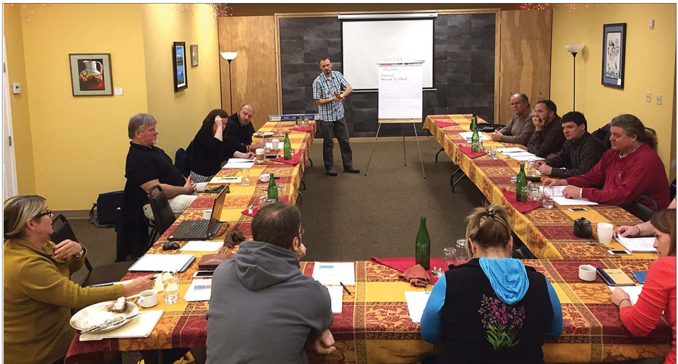
The Mat-Su CVB Board of Directors prioritizes goals and programs for the FY2016 budget during the annual retreat in January. This year's retreat was in Palmer, including an overnight at Colony Inn, a planning session on the Alaska State Fairgrounds and breakfast at Turkey Red.