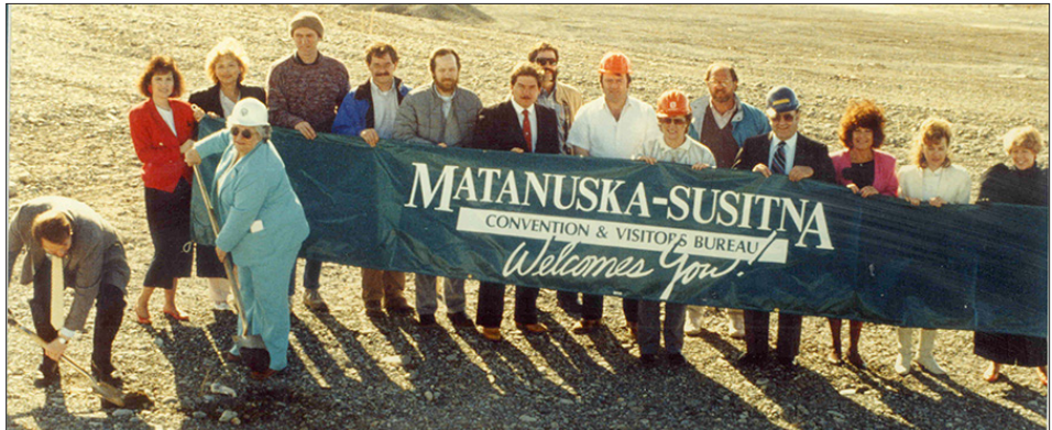
Volunteers and local leaders break ground on the current site of the Mat-Su Valley Visitor Information Center in 1989.

The property's new owner, Spring Creek, will begin construction this summer on the new Mat-Su Colony Senior