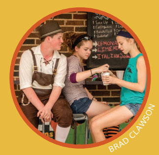
OKTOBERFEST Last Weekend in September