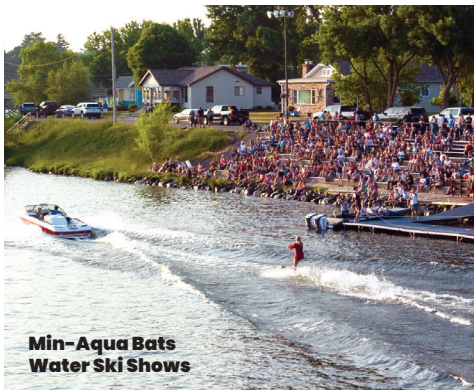
Min-Aqua Bats Water Ski Shows