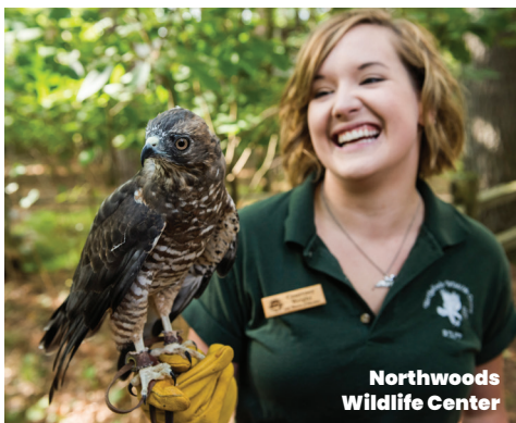
Northwoods Wildlife Center