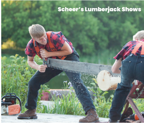
Scheer's Lumberjack Shows

Make Minocqua and our lakeside lodging and dining your home base!