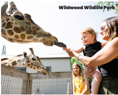
Wildwood Wildlife Park