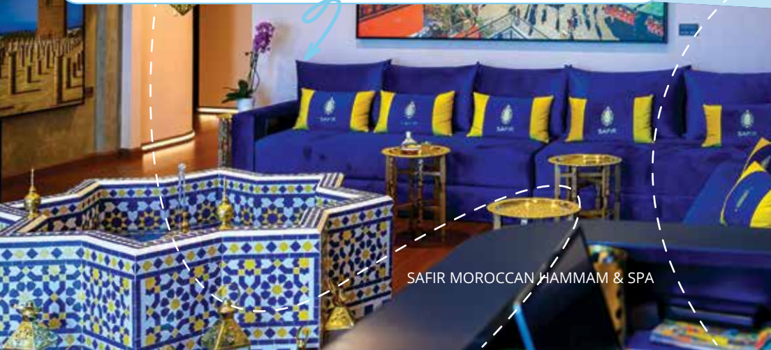
SAFIR MOROCCAN HAMMAM & SPA