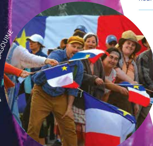
LE PAYS DE LA SAGOINE

Take a break from your cultural deep dive for a tour and tasting at Crooked River Distillery just outside the city in Memramcook, or take in some natural history at La dune de Bouctouche or Kouchibouguac National Park (about an hour away.)