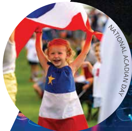
YQM COUNTRY FEST

Moncton-Dieppe is coming in hot with a non-stop lineup of can't-miss events and festivals. From big, bold flavours and sophisticated sips, to bright lights and cowboy boots, we'll keep your social schedule stacked all year long!