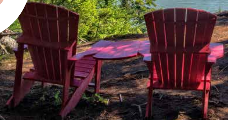
FUNDY NATIONAL PARK