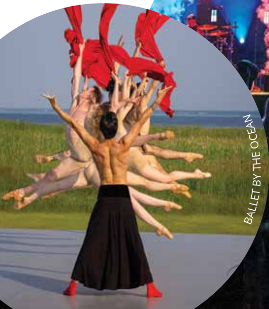
BALLET BY THE OCEAN