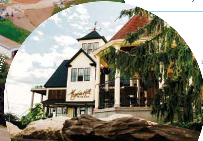
MAGNETIC HILL WINERY

Ending your day on a high note is a safe bet, whether you choose a night of games and live entertainment at Casino NB or unwinding at Magnetic Hill Winery with fine wine, shareable bites, and panoramic views of the city.