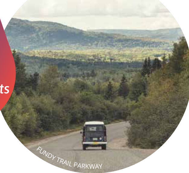
FUNDY TRAIL PARKWAY