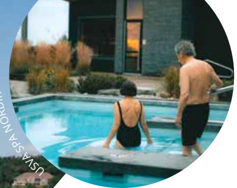
USVA SPA NORRISK