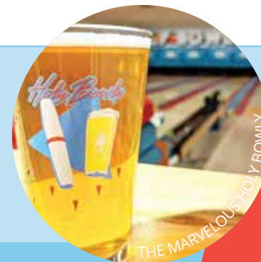
THE MARVELOUS HOLY BOWLY

If the Great Outdoors is calling your name, check out: